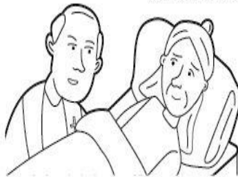
ANOINTING THE SICK