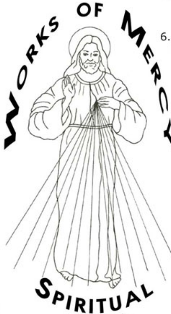
6. To forgive injuries.