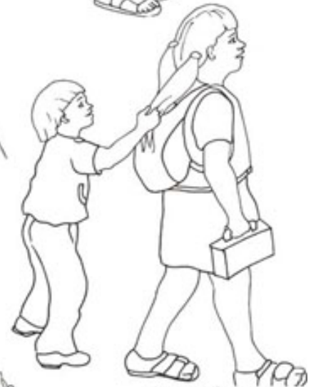
5. To bear wrongdoings patiently.