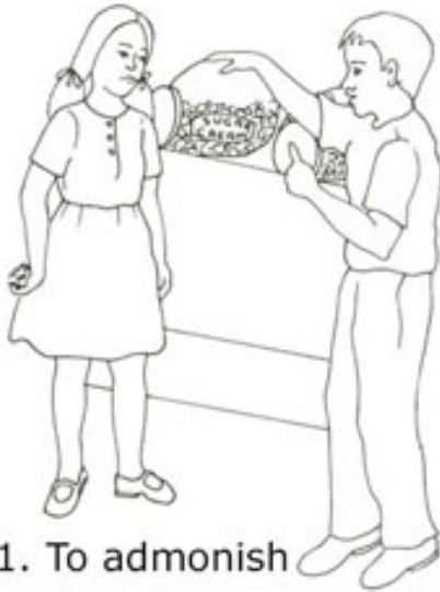
1. To admonish the sinner.