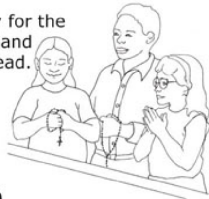
7. To pray for the living and the dead.