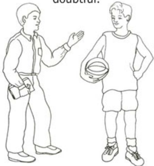
3. To counsel the doubtful.