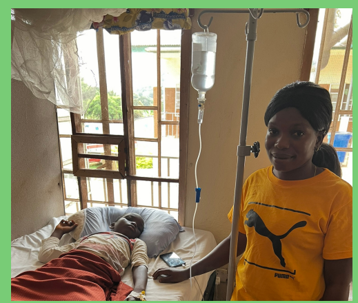
Pediatric patient with malaria