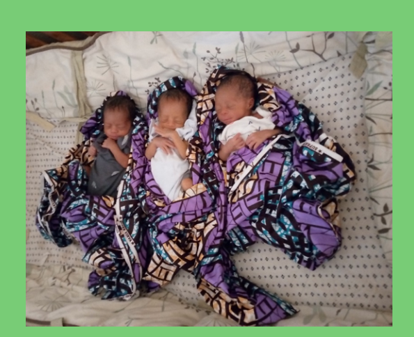
1st triplets delivered