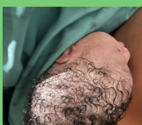
From birth immediately to his mother's bosom