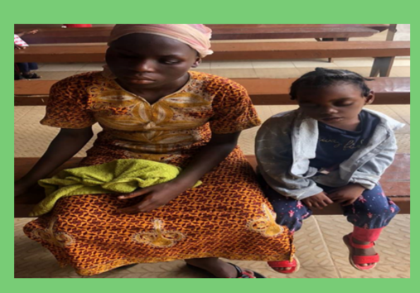
Patients from the Kabala School for the Blind