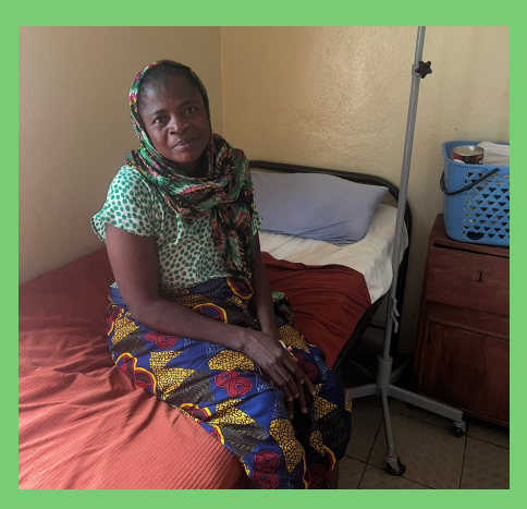
Cardiology patient who cannot be fully treated sine the clinic does not have that expertise