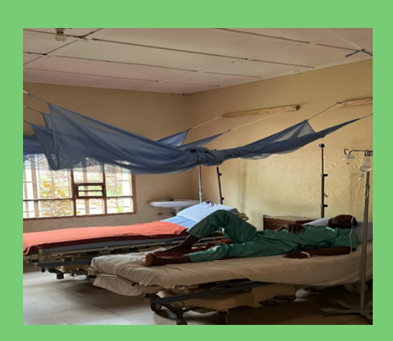
Patient in male ward being treated for malaria