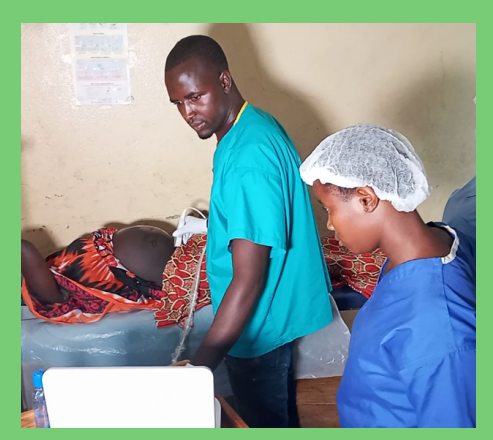
Ultrasound in progress