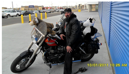
On my first street bike going on the Edmonton Toy Run.

Biggest riding achievement for me I would say, is just supporting all my favourite charities that are helpful to the riding community and the community in general. Cancer Rides, Memorial Rides and Toy Runs are by far my favourite!