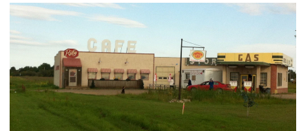
Stopped at The Ruby Cafe in Rouleau, Saskatchewan where they filmed Corner Gas TV Sitcom.

I've done a few long distance trips in my time riding. BC bike trips here and there are always fun and memorable because of the scenery. But the most memorable long distance trip I did was riding solo to Carman, Manitoba to see my Grandmother. There's something about travelling alone and riding at your own pace that's so peaceful and soulful. You can ride as long as you want or stop as many times as you want, whenever and wherever you want. On the return trip home I pushed hard to make my destination and rode 1100 km from sun up to sun down. That's personally my most memorable trip and I'm yet to break my own distance record.