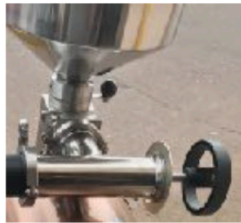
NEW FOR 2018! MDDS AIRFLOW SYSTEM FOR PRECISE AIRFLOW