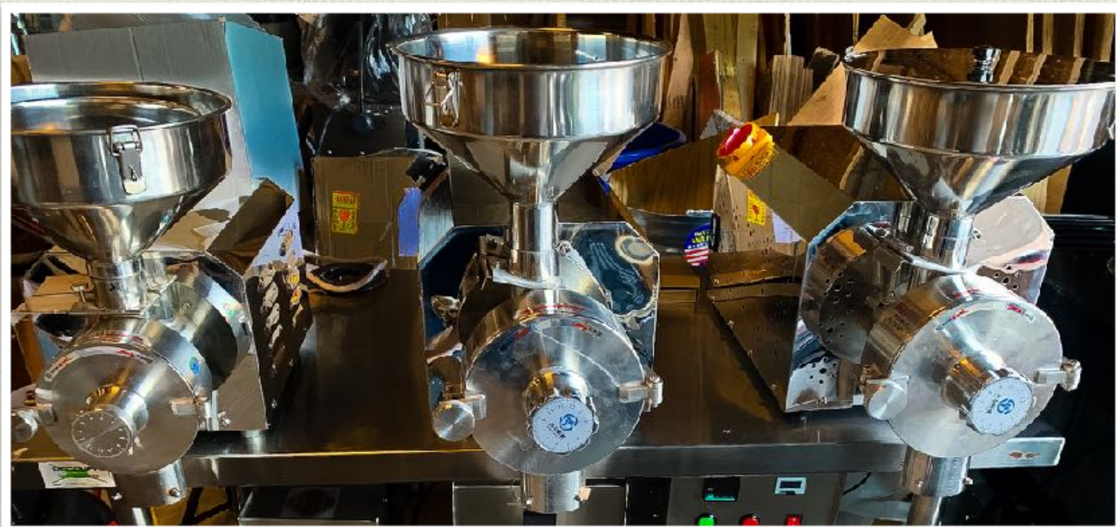
BC-66 (GRAND OR GRAND STAND)