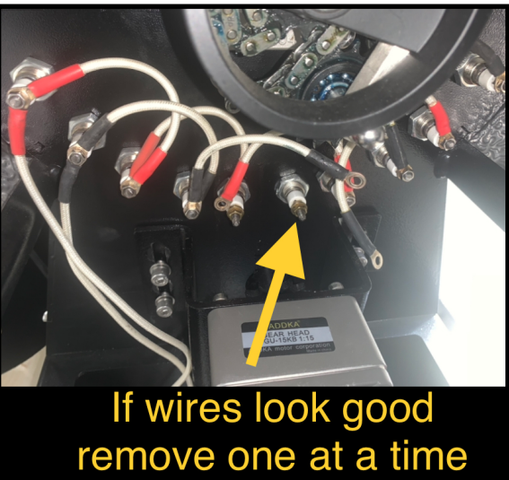
to find bad heat tube

9. BY REMOVING THESE WIRES WE CAN CHECK AND BE SURE ISSUE IS WITH THE HEAT ELEMENTS. ONCE THESE WIRES ARE REMOVED AND TAPED YOU CAN PLUG ROASTER BACK IN AND IF BREAKER DOES NOT TRIP OFF THEN OUR NEXT STEP WILL BE TO FIND WHICH HEAT ELEMENT IS SHORTED AND DEFECTIVE.