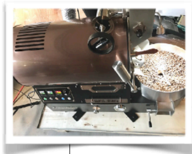
BC-3 HAS TWO 76MM (3") EXHAUST PIPES

THE BC-3 MD IS A HEAVY DUTY ROASTER BUILT WITH A CARBON STEEL BODY WITH APPROVED POWDER COAT HIGH TEMPERATURE BODY IN BLACK. THE HOUSINGS COME IN MANY CHOICES. TWO EXHAUST PIPES COMES OFF THE BC-3 AT 3" AS SHOWN BELOW AND CAN BE EXHAUSTED OUT OF BUILDING SEPARATELY OR CONNECTED WITH A BLAST OR BACKDRAFT DAMPER