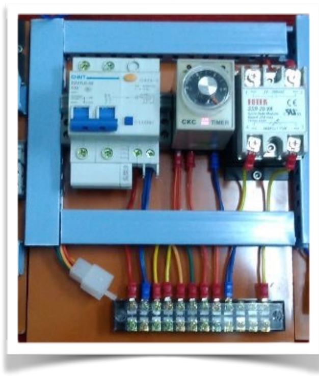
ELECTRONIC BOARD SAMPLE