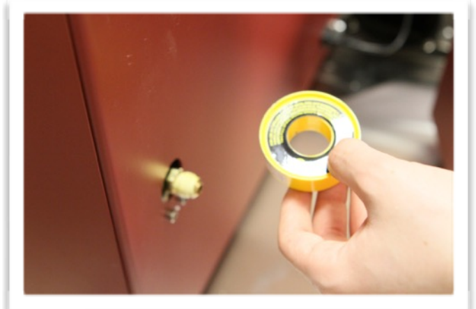
USE YELLOW LPG TAPE AT CONNECTOERS