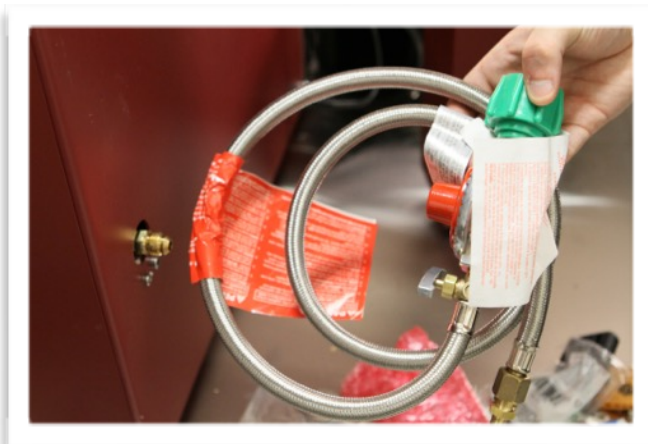
INEXPENSIVE TEMPORARY REGULATOR

IF YOU PURCHASED AN LPG GAS MODEL YOU WILL NEED A HIGH PRESSURE ADJUSTABLE LPG REGULATOR. YOU CAN PURCHASE A MODEL SIMILAR TO THE BRAND IN PICTURE BELOW WITH ATTACHED GAS LINE. WE RECCOMEND IF YOU ARE DOING A PERMANENT INSTALL THAT YOU RUN A PERMANENT GAS LINE WITH A PROPER REGULATOR. ALWAYS USE LPG TAPE AND JOINT COMPOUND WHERE NEEDED AT CONNECTORS.