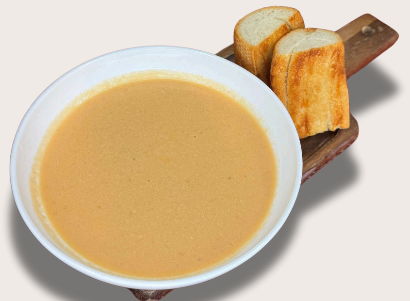
SALMON CHOWDER CREAM SOUP