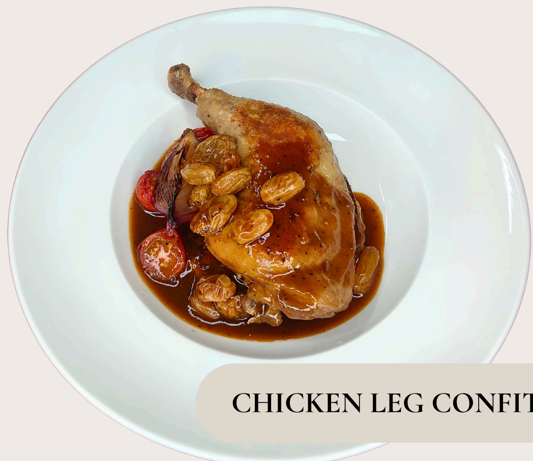
CHICKEN LEG CONFIT