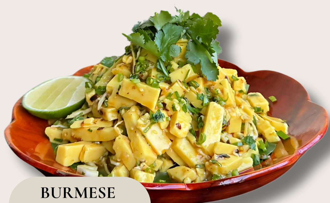
BURMESE TOFU SALAD