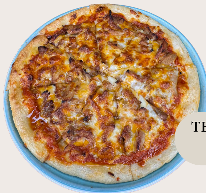
TERIYAKI CHICKEN PIZZA