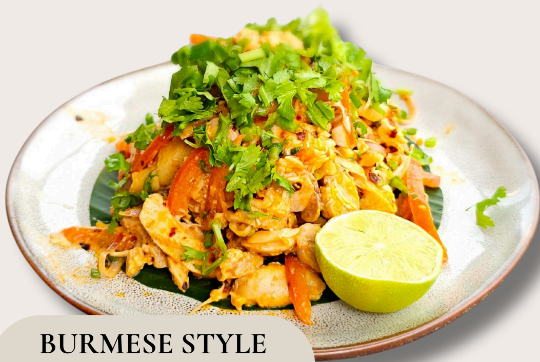
BURMESE STYLE CHICKEN SALAD