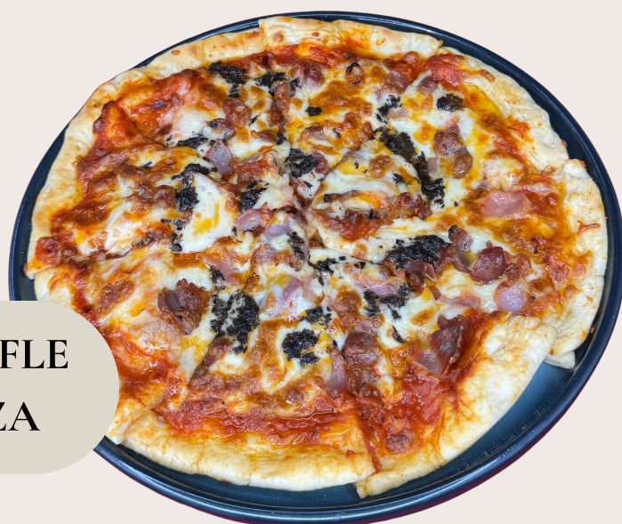
BACON AND TRUFFLE MUSHROOM PIZZA