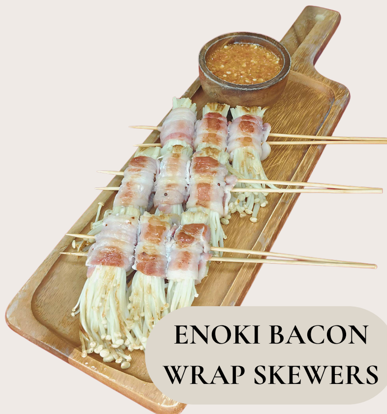
ENOKI BACON WRAP SKEWERS