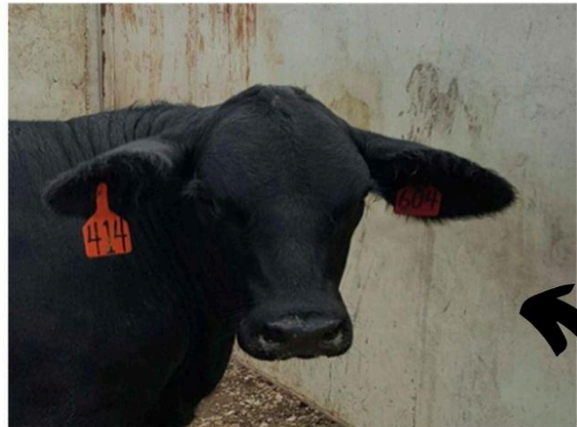
Brahman Influenced Head and Ears showing signs of being “broken” or downward turned

*For additional information reference the following site: http://animalscience.tamu.edu/wp-content/uploads/sites/14/2012/04/2017-21-Texas-Show-Steer-Classification-050916.pdf