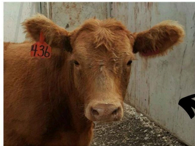
NON Brahman Influenced Head and Ears