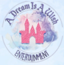
A Dream is a Wish Entertainment