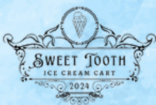
Sweet Tooth Ice Cream Cart