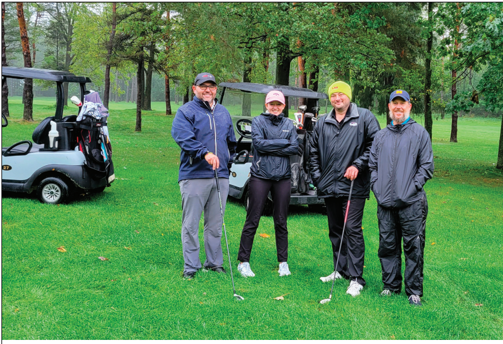
The Rain Did NOT Stop Our MIPA Golfers!

When I talk about the Michigan Parking Association (MIPA), I cannot help but do so with extreme pride and excitement. MIPA has come a long way in the past year thanks to the tireless work of so