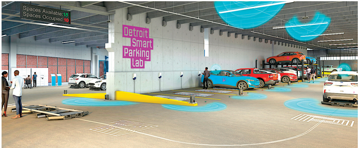
Inside the Detroit Smart Parking Lab

Michigan had the first mile of concrete pavement (on Woodward Ave) in 1909. We had the first lined road (River Road in Trenton) in 1911. In 1920 we were the first state to embrace the four-way, three colored traffic light system.