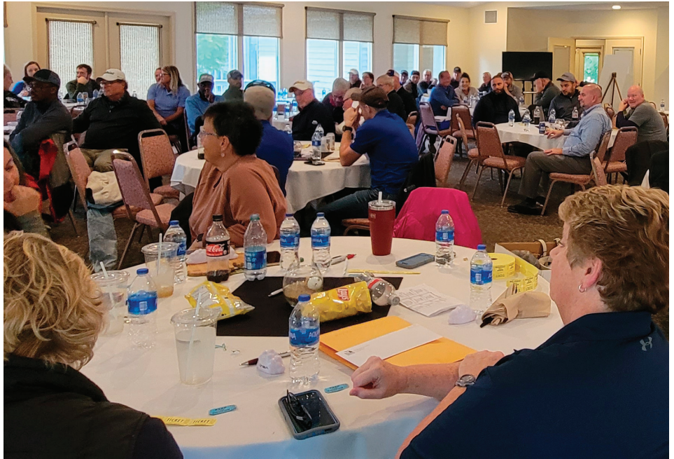
A Great Turnout at the MIPA Fall Conference

professional network in parking and mobility. We need your voice, and you want to be a member of our community!