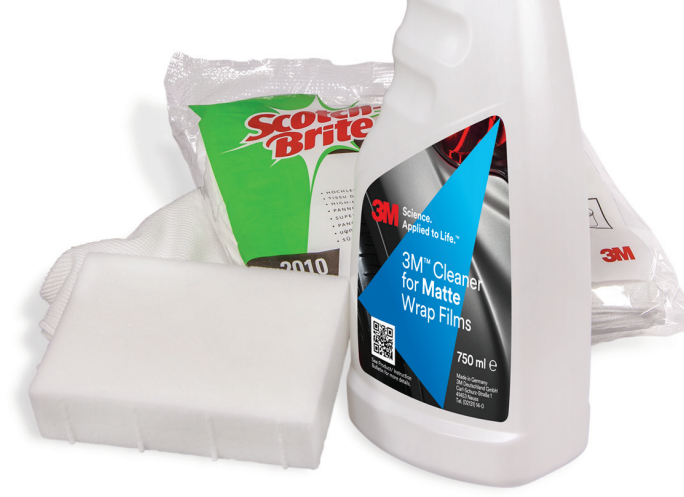
03 / 2016 Printed in Germany. © 3M 2015 All rights reserved.