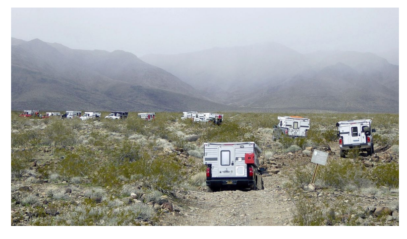
2019 Mojave Road Tour

I will be re-scheduling Death Valley and Mojave Road Tours for April, 2020.