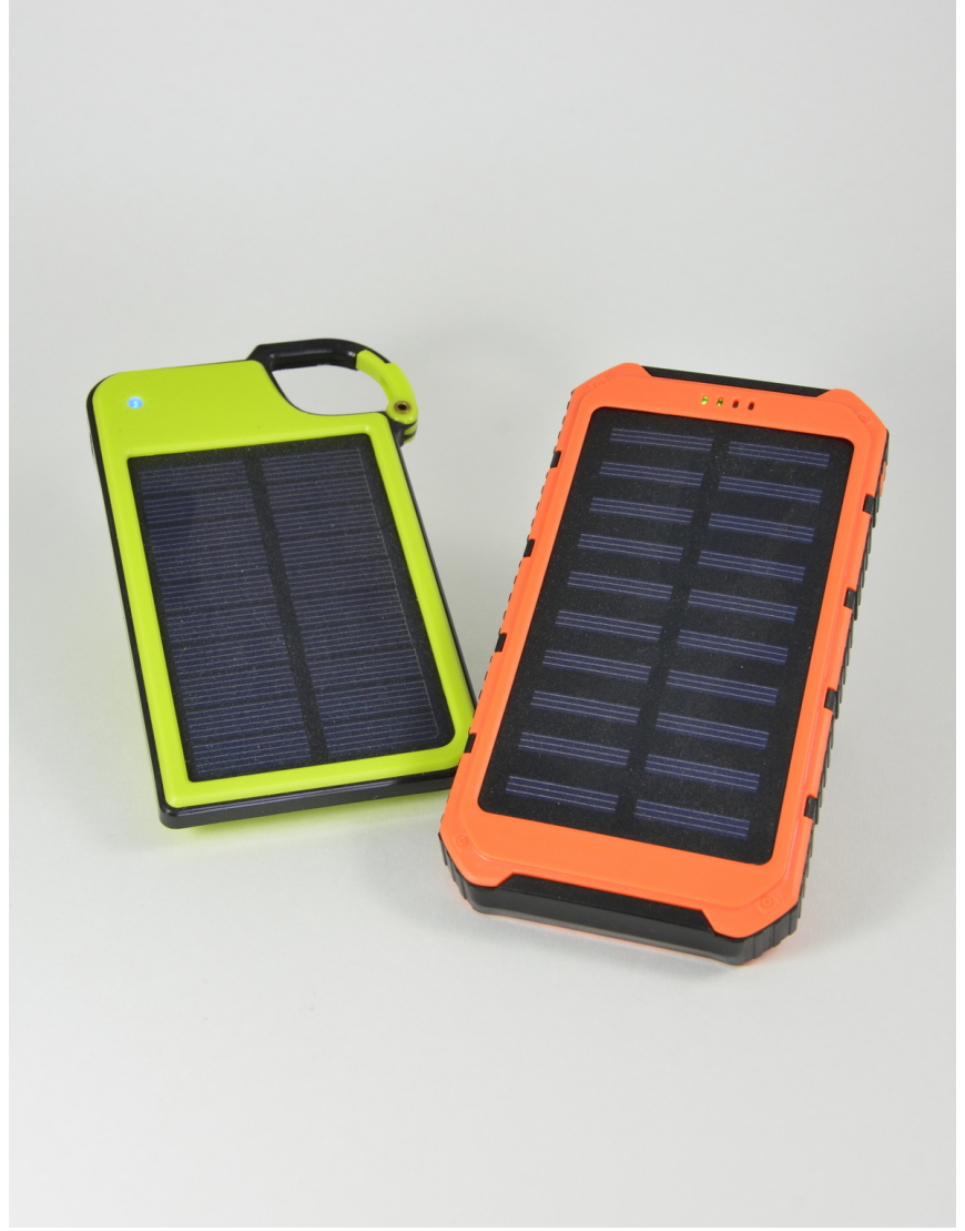
Fairly Inexpensive Solar Batteries Used To Recharge Smartphones and Tablets