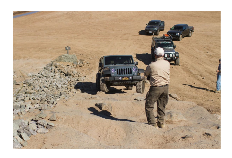
Click Here To Go To Course Schedule

Prerequisite: None, but consider completing the Intro to 4WD Discovery Course first. Length of Course: Two days. Vehicle Requirements: Any reliable 4-Wheel Drive SUV, SUT or truck with: 1) 2-speed 4WD transfer case (must be able to shift into a 4-Low gearing), 2) Street legal, 3) Full-size spare tire, 4) Full tank of gas, 5) Seat belts for all passengers, 6) Vehicle in excellent working condition, no fluid leaks, etc. 7) Consider owning a winch for this course (but not required).