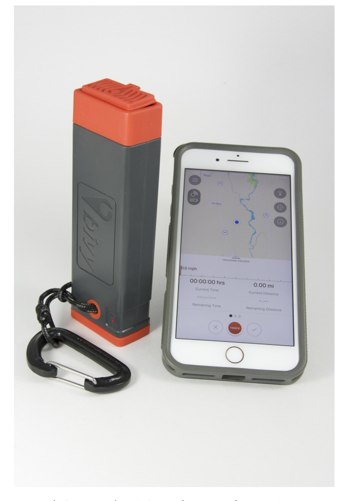
Bivystick Connected To A Smartphone Via The Bivy App

• Cons: Device does NOT Have A Dedicated SOS Button – MUST Connect Via Bluetooth To The Bivy App To Press A Virtual SOS Button. Has No Information Screen – Must Use A Smartphone Or Tablet. Bivy App Is NOT Formatted For Increased Tablet Screen Size – Looks Like A Phone App In The Middle Of A Tablet Screen. Tablet Screen Image Cannot