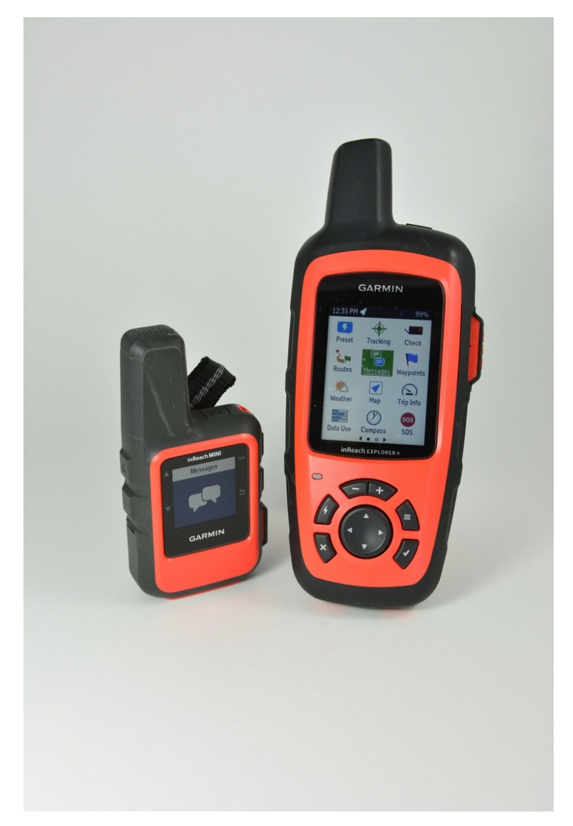
Garmin inReach Mini Next To inReach Explorer+

Text Messages Through Garmin Compatible Devices (Smartphones, Tablets, Other Garmin