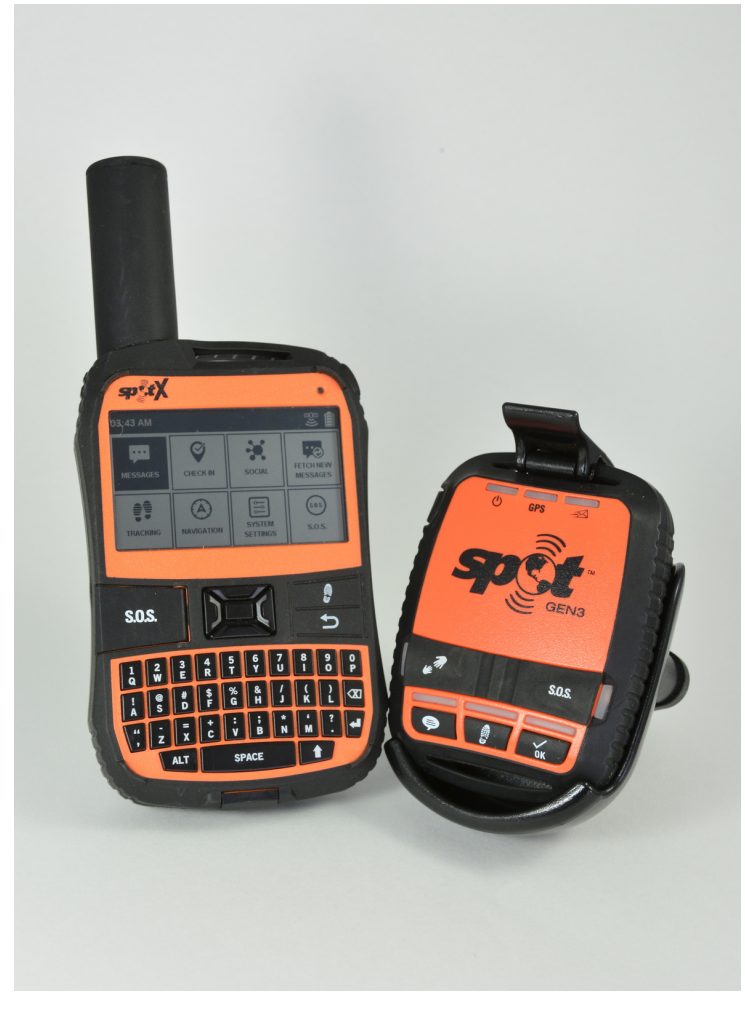
SPOT X Next To The Gen 3 SPOT Device