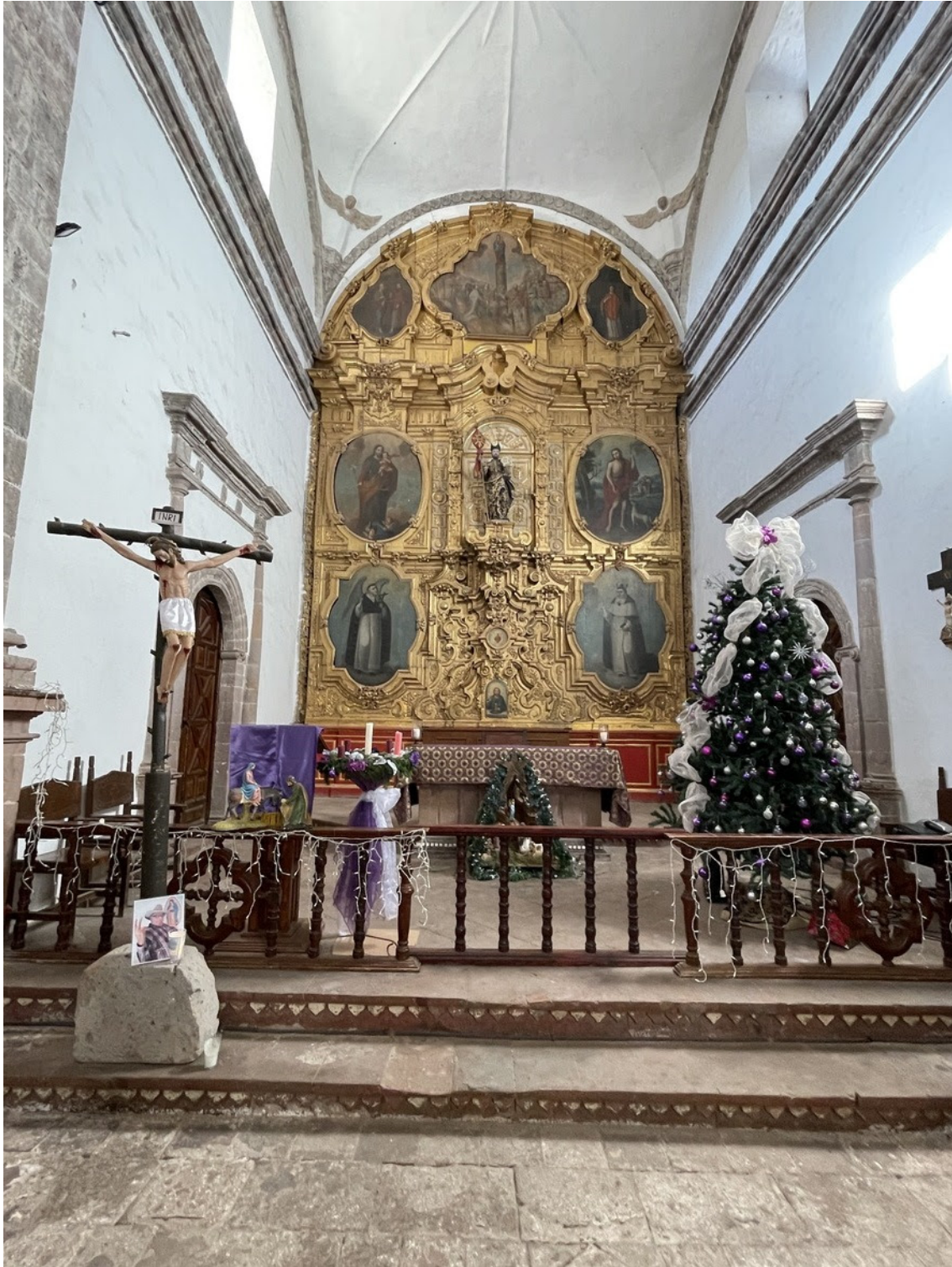
Inside Mission San Ignacio