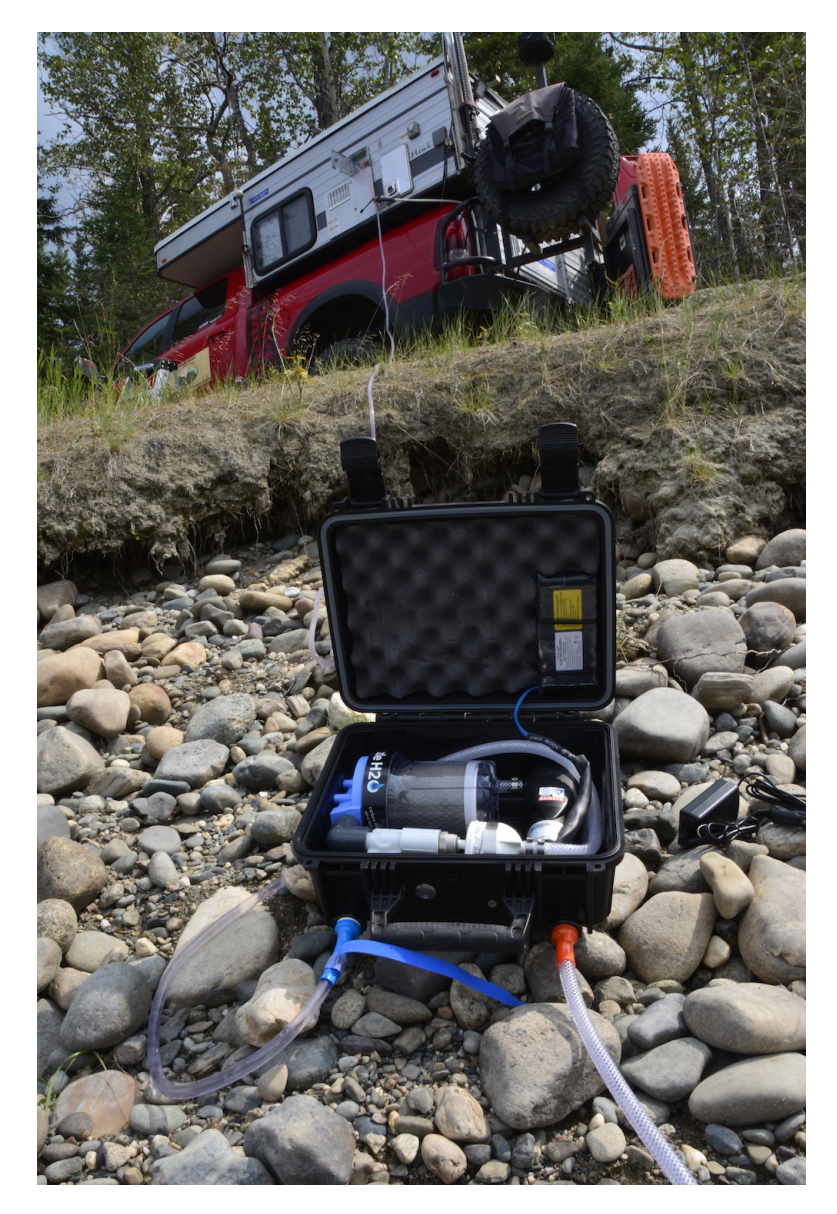
The GuzzleH2O Stream in Action

"The single biggest threat to man's continued dominance on the planet is the virus." –Joshua Lederberg Ph.D.