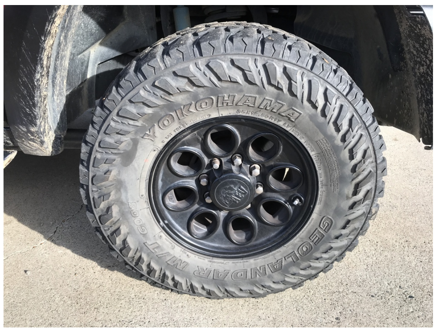
Can You Believe These Tires Have 35K Miles On Them?

Thirty-two thousand miles ago, I was in the hunt for an E-Load Range (10 ply) tire for my PowerWagon that had a newly purchased Four Wheel Camper on the bed. I won't mention the brands, but for several years I'd been unimpressed with the mud-terrain tires I had purchased