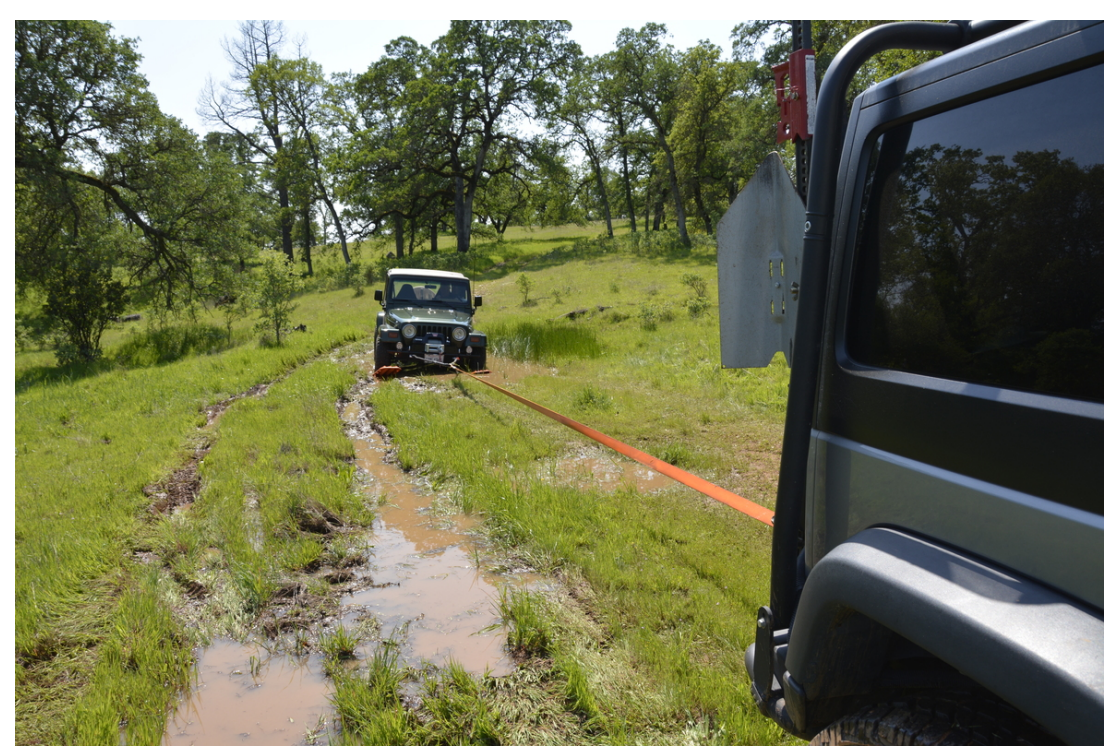
Kinetic Energy Recovery.