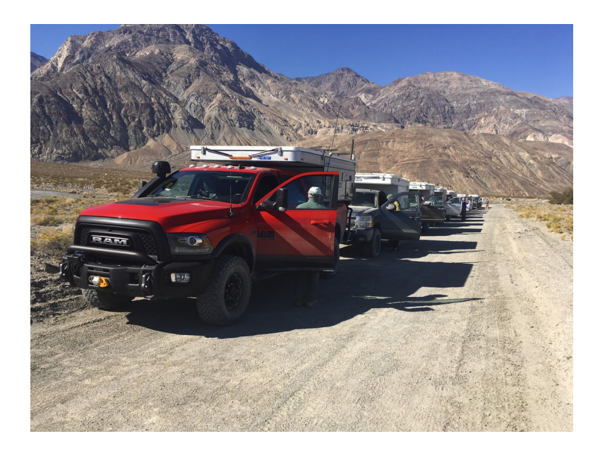
Death Valley FWC Adventure Tour.

Wheel Campers invite you to explore the remote backcountry with like-minded vehicle-supported adventurers. This is our third year offering these enormously popular tours. Come along and see new sights, camp in new locations, meet new friends, and learn how to off-road safely. Each tour includes unique