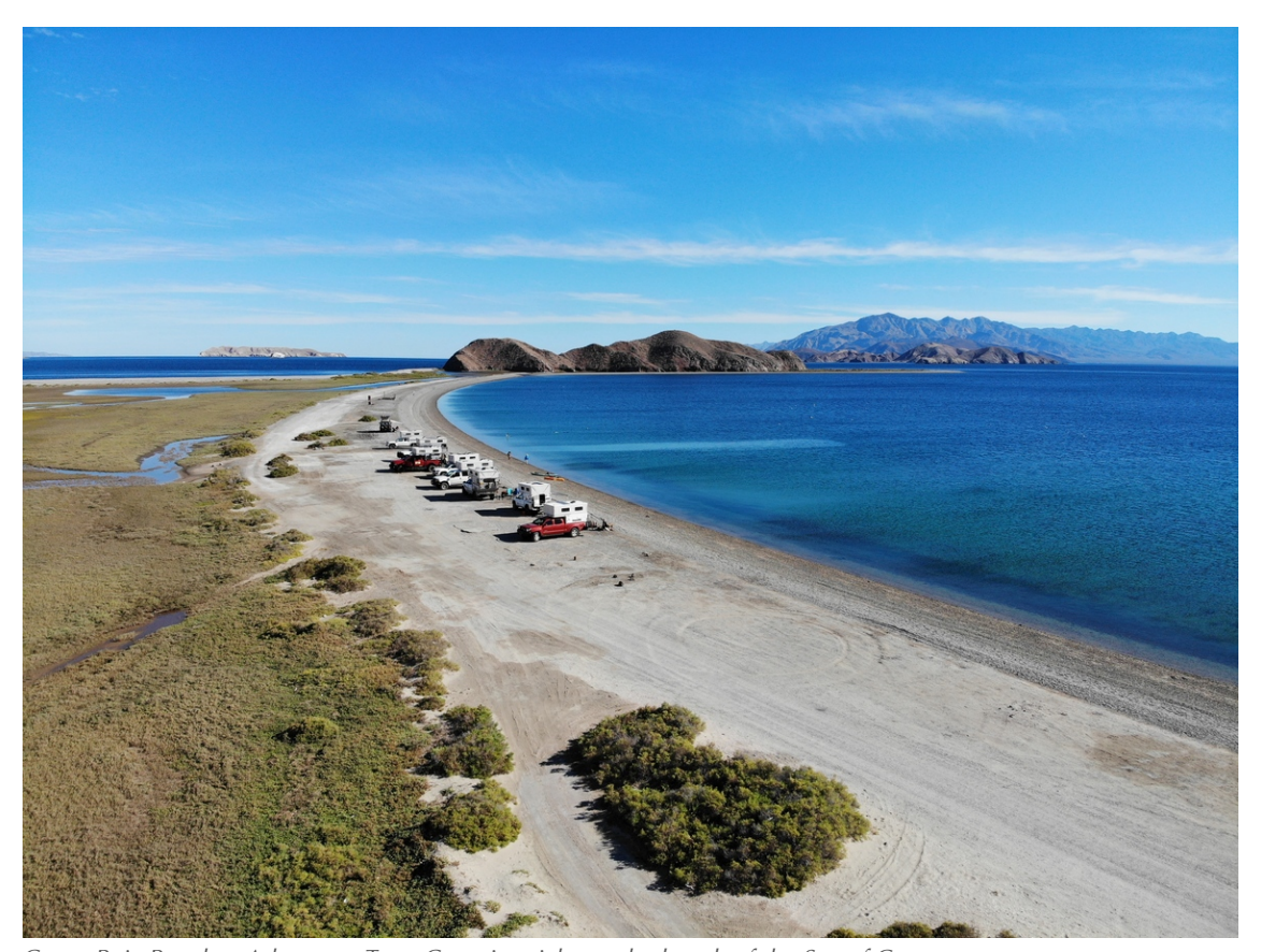
Camp Baja Beaches Adventure Tour. Camping right on the beach of the Sea of Cortez.