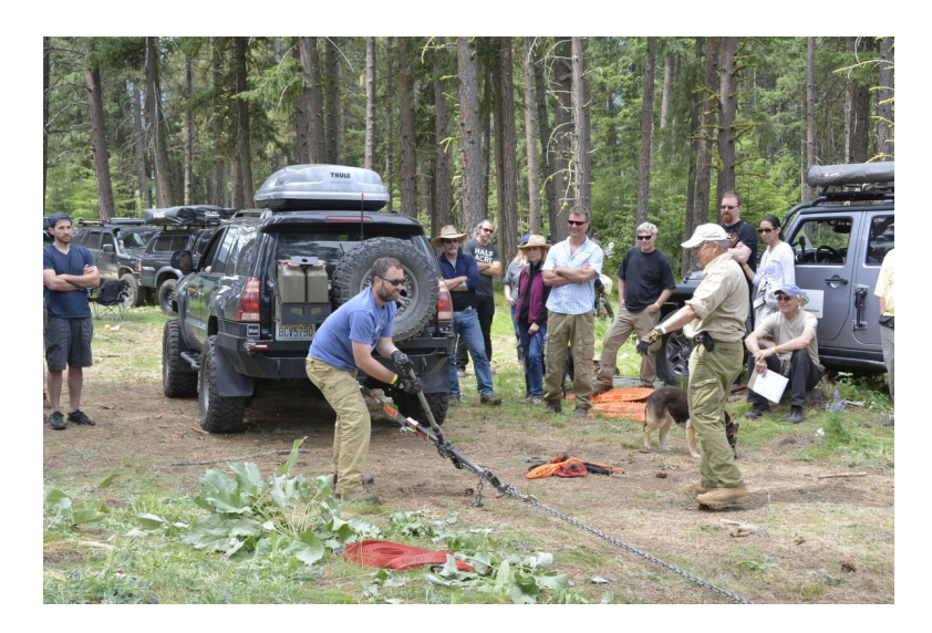
Learning Hand Winching.