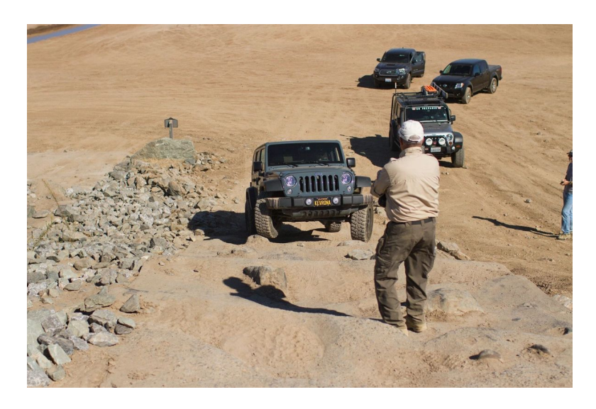
Learning Rock Crawling & Hill Climbing.

Want to learn more about your 4-Wheel Drive vehicle? Want to improve your off-road driving skills? Interested in keeping you and your loved ones safe while off-roading? Off-Road Safety Academy<sup>TM</sup> will safely teach you in one weekend what it takes most people years to learn on their own.