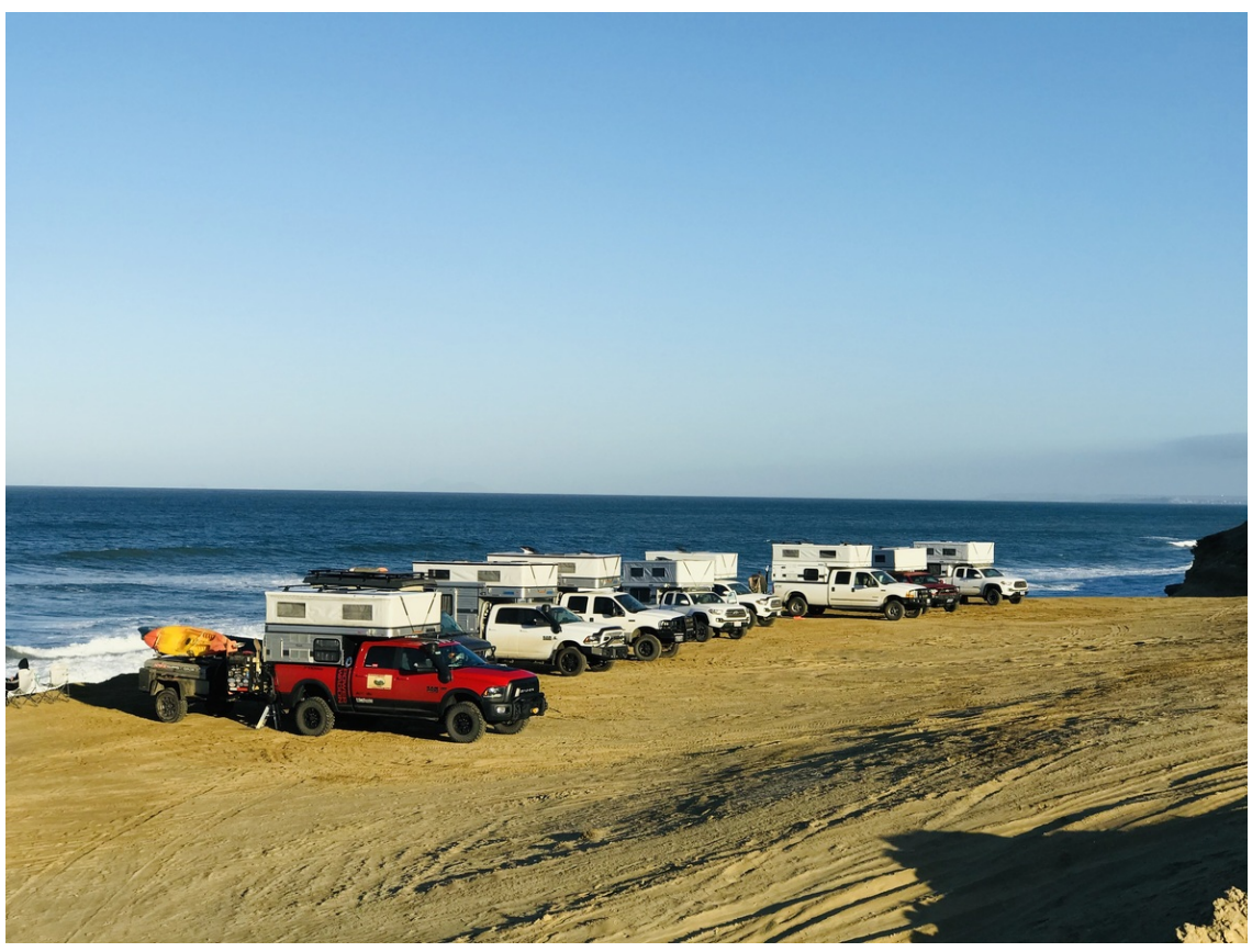
Camp Baja Beaches Adventure Tour. Pacific Coast campsite.