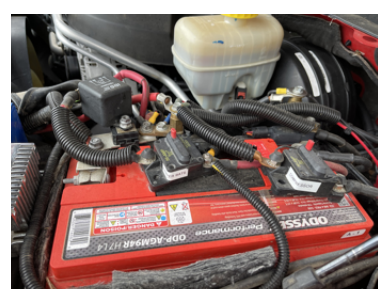
The 6-gauge positive and negative cables routed back to my camper's battery box begin in my truck's engine compartment. The cables are connected to the positive and negative terminals on the starter battery. Visible is the 80-amp circuit breaker connected to the positive cable.