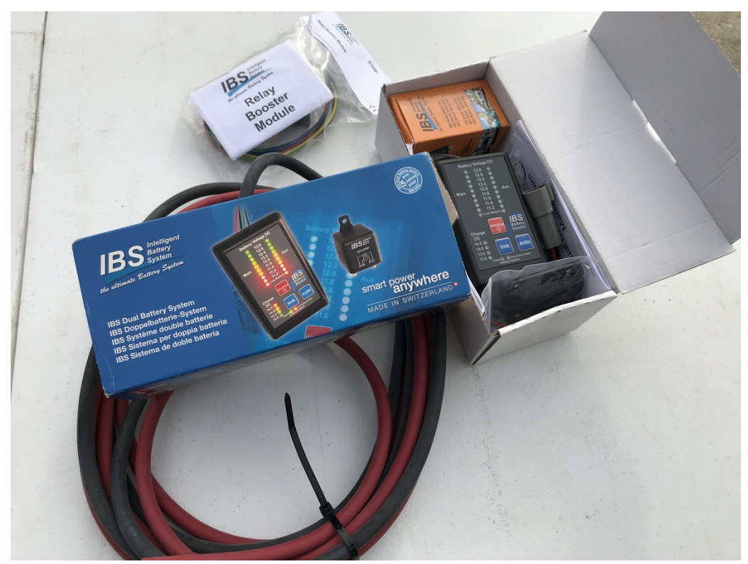
Unboxing of my IBS battery minder, starter battery isolator, and 12-volt monitor.

sold in the USA by Equipt Expedition Outfitters. See this product HERE. I have also owned this product and found it to be very good.