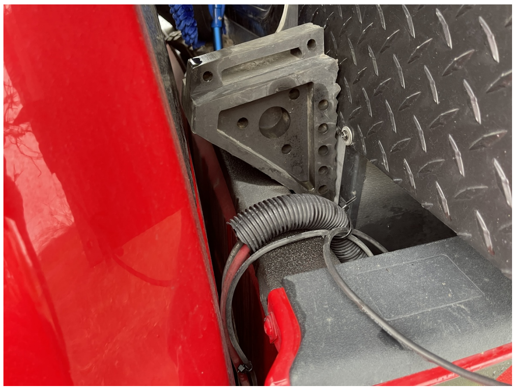
Pictured are my 6-gauge cables routed between my truck cab and bed holding my camper. The cable comes from the engine compartment, carefully routed under the cab's frame and up and over the top of the bed. The cable lays in the space between the camper and truck's bed, all the way to the camper's battery box. Obviously, I had to drill a hole into my camper's battery box to route the cable.