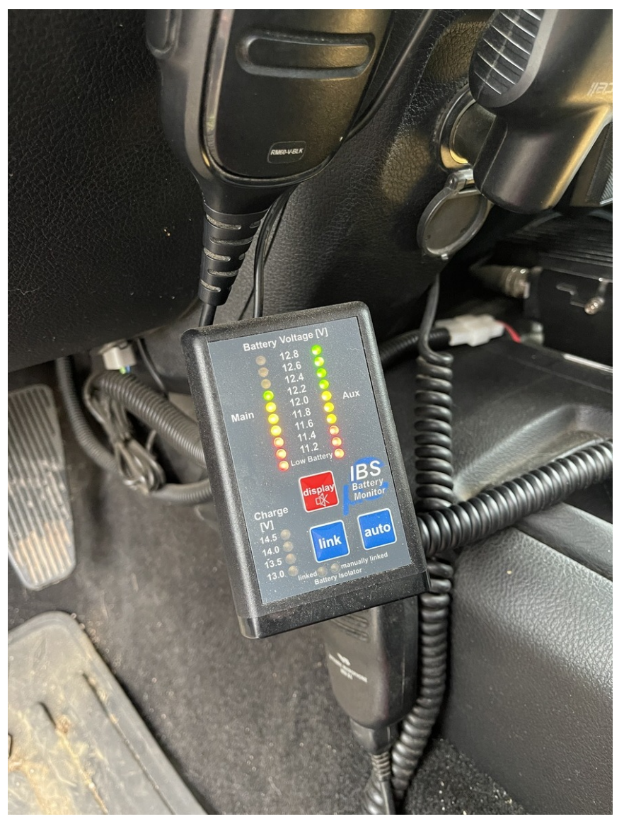
Cab mounted IBS 12-volt monitor.