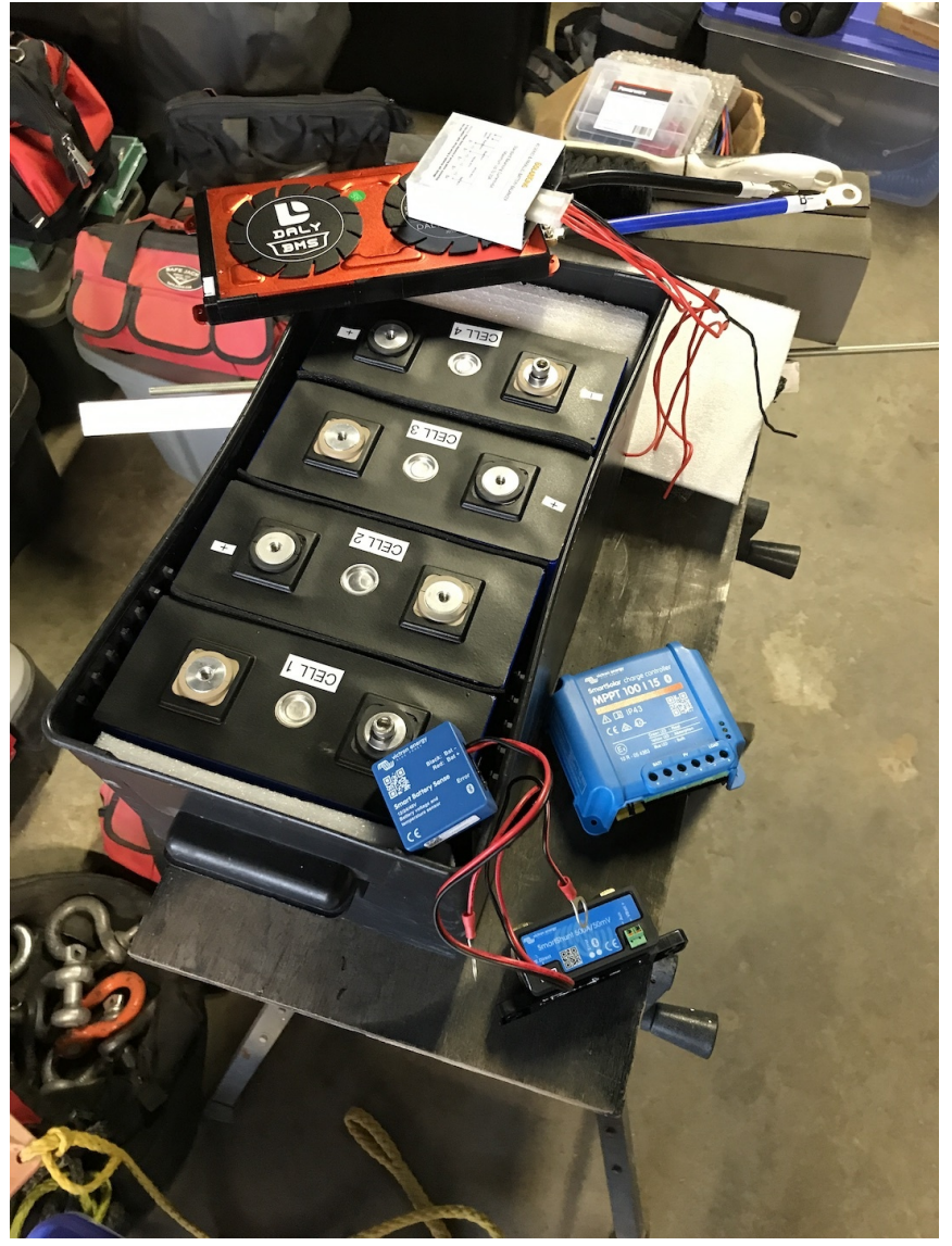
Pictured is the beginning of my battery box build.