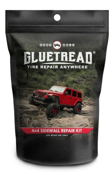
4X4 KIT $59.95 USD

At this point in time there are two GlueTread products, or shall we say "kits," designed for larger full-size 4WD vehicle tires. Those two kits are shown here – their "Complete Tire Repair Kit" ($125) and "4X4 Kit" ($59.95). I used the 4X4 Kit to repair the sidewall tear on my tire as I do not feel that the "Complete" kit is worthy of purchase.