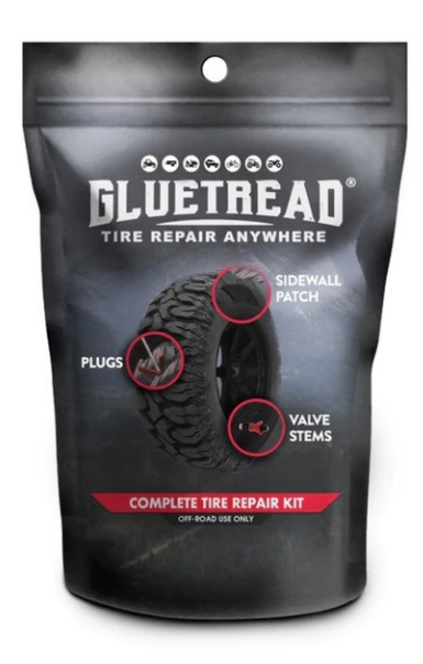
COMPLETE TIRE REPAIR KIT $125.00 USD

patch. As with most tire repairs in the field, these are only "trail-fixes." GlueTread products acknowledge this fact. They do not suggest that their sidewall repair patches should be used on paved highways. One product warning on the packaging states: "Intended as a temporary patch, seek professional attention as soon as possible." Trail-fix tire repairs are only designed to get you out of the remote backcountry and return to the pavement should you not have a spare tire to change to (shame on you) or your spare is already damaged.