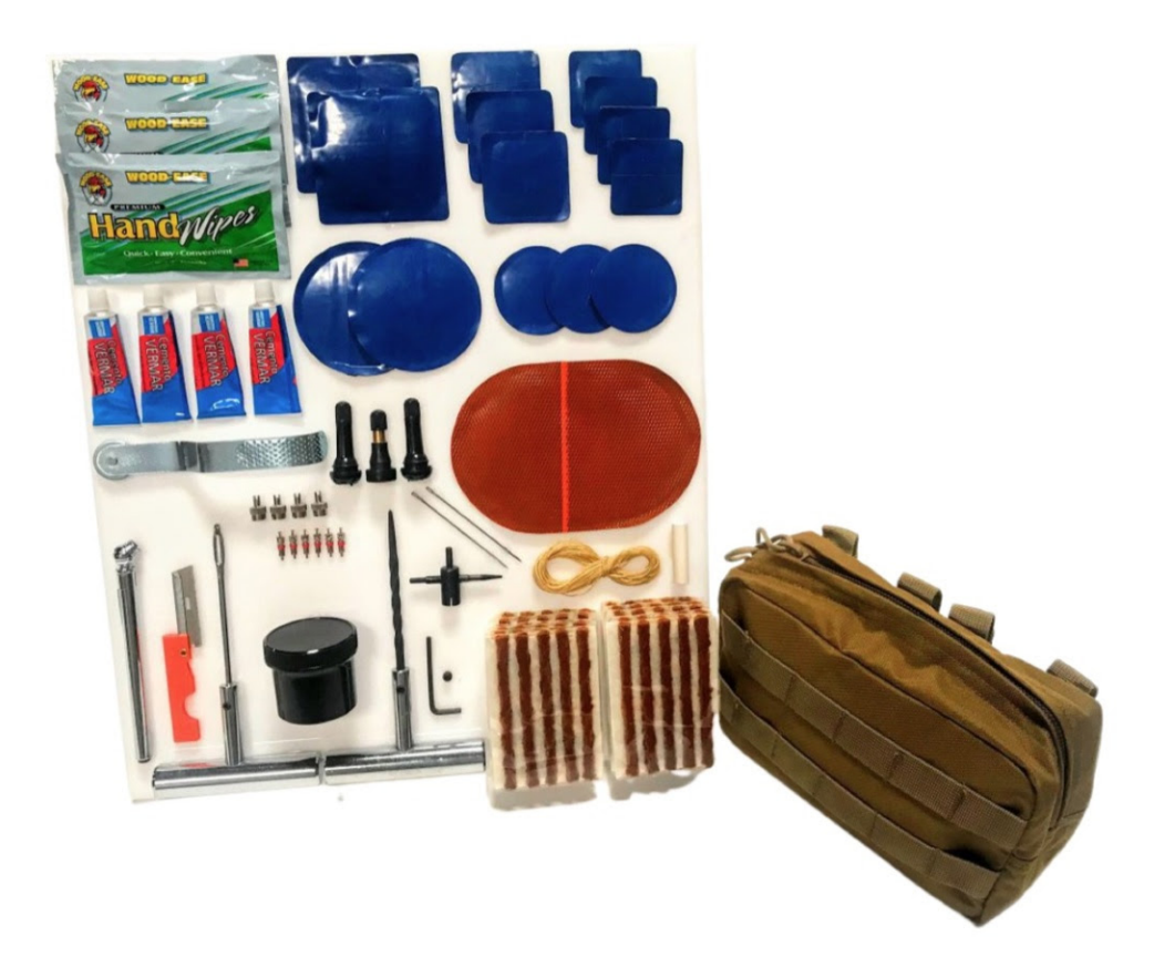
Extreme Outback Products Ultimate Tire Repair Kit

Another reason I can't endorse their Complete Tire Repair Kit is that it's more expensive than the much better Extreme Outback Products Ultimate Puncture Repair Kit ($99.95). The Ultimate Tire Repair Kit has metal handled Probe and Insert Tools. Plus, the Ultimate Puncture Repair Kit has many other important items needed for better and more complete in-field tire repairs – like internal patching of sidewall tears. In my opinion, the best in-field tire repair kit on the market today is still the Extreme Outback Products Ultimate Puncture Repair Kit (see HERE).