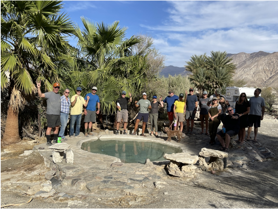
Death Valley Tour

To learn more about these 2025 tours go HERE . If you have additional questions, feel free to call: 909-844-2583.