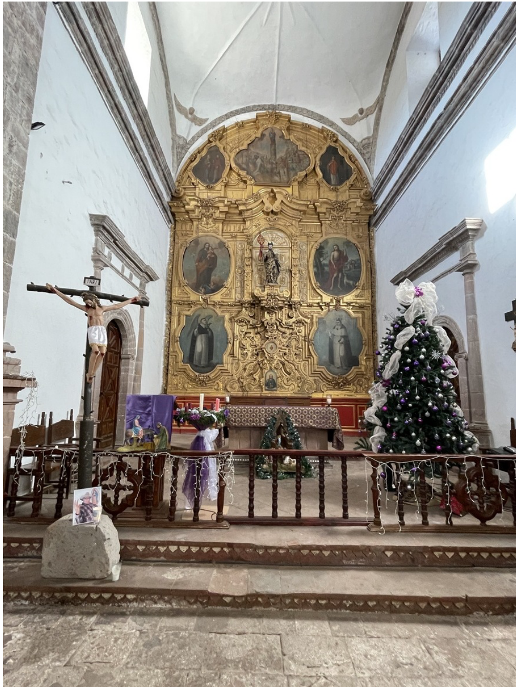
Inside Mission San Ignacio