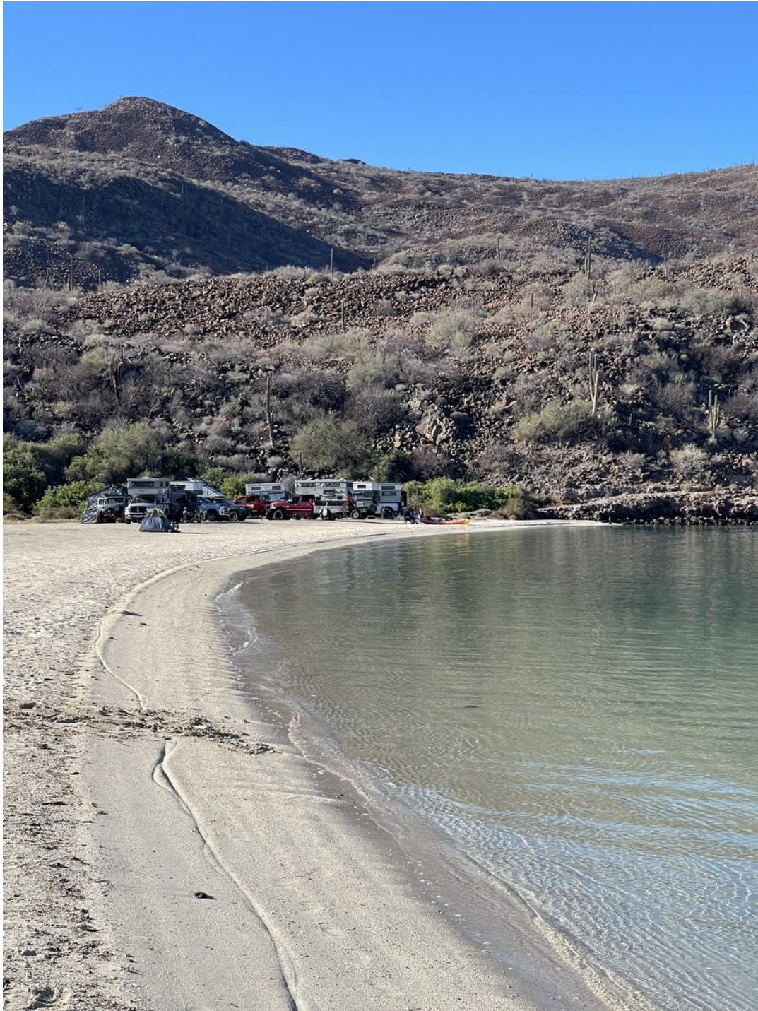
Bay of Conception

Read My Newest Article in Truck Camper Adventure Magazine