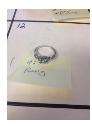
Dee R. / 925 Ring