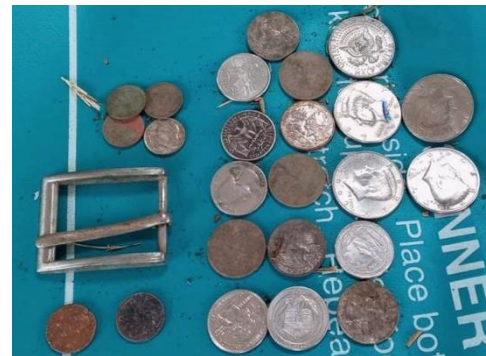
PHOTOS FROM THE FUN HUNT