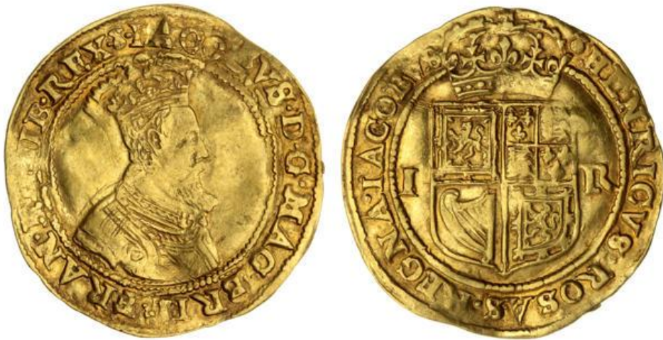
A rare, James I Scotch double-crown of six pounds.

"The Maisters were perhaps the most influential mercantile family in Hull from the late 16th to 18th centuries, trading as importers and exporters of iron ore, timber and coal from the Baltic; several generations served as Members of Parliament in the early 1700s," the release stated.