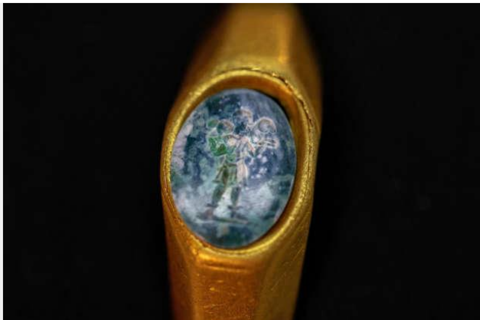
1 of 16 Photos in Gallery

Natalie Neysa Alund covers trending news for USA TODAY. Reach her at nalund@usatoday.com and follow her on Twitter @nataliealund .