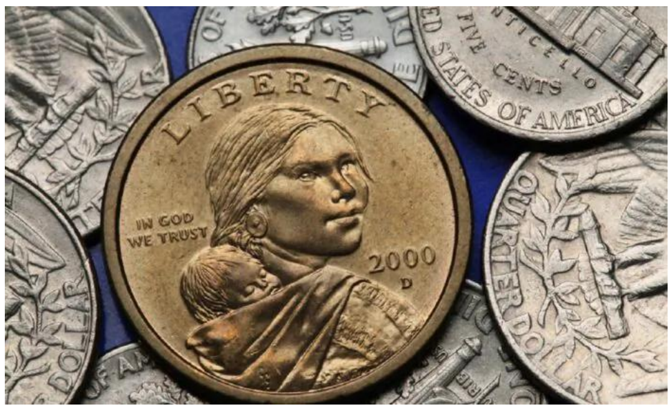
Sacagawea with her child depicted on the US Sacagawea dollar.