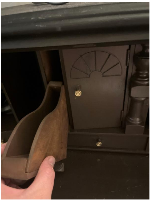
A secret compartment in the secretary desk.