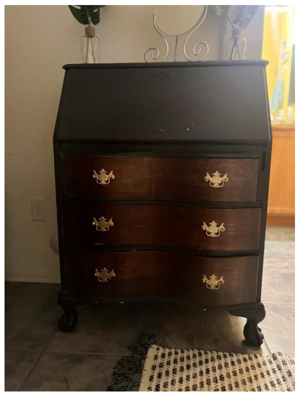
The secretary desk was bought at a Goodwill store.

To her surprise, while taking the desk inside her house, it tipped over to reveal unexpected contents.