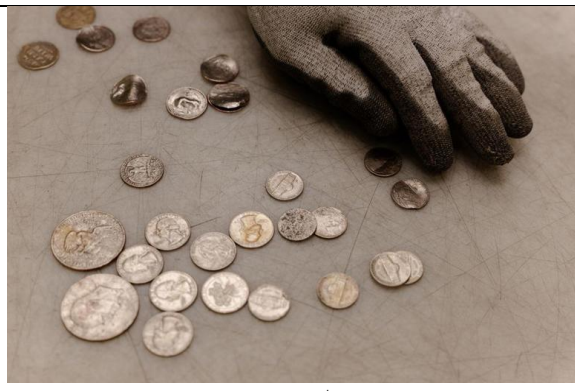
Americans Throw Away Up to $68 Million in Coins a Year. Here Is Where It All Ends Up.

The coin recovery program is just a small part of Reworld's revenue. The company makes most of its money from operating incineration facilities that burn trash to generate fuel.