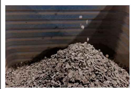
Americans Throw Away Up to $68 Million in Coins a Year. Here Is Where It All Ends Up.

On a recent Monday, a bucket loader lifted trash from its waste facilities into various sorting machines. A rattling gray one separated out anything that was the color of a coin. Another one separated anything round and flat, like a coin. And another machine separated heavier metals like coins from lighter metals like aluminum.