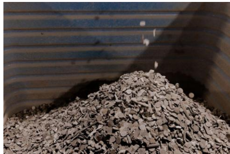
Americans Throw Away Up to $68 Million in Coins a Year. Here Is Where It All Ends Up.

On a recent Monday, a bucket loader lifted trash from its waste facilities into various sorting machines. A rattling gray one separated out anything that was the color of a coin. Another one separated anything round and flat, like a coin. And another machine separated heavier metals like coins from lighter metals like aluminum.