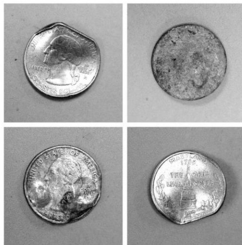
Americans Throw Away Up to $68 Million in Coins a Year. Here Is Where It All Ends Up.