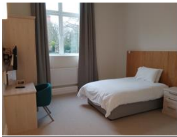
One of our 10 single en-suite bedrooms