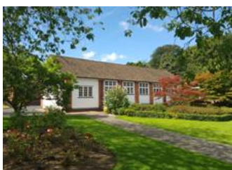
Our day conference centre