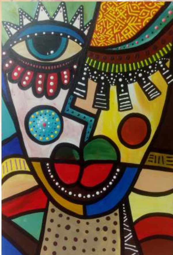
Her Passion, acrylic on canvas 61cm x 92cm, 2019