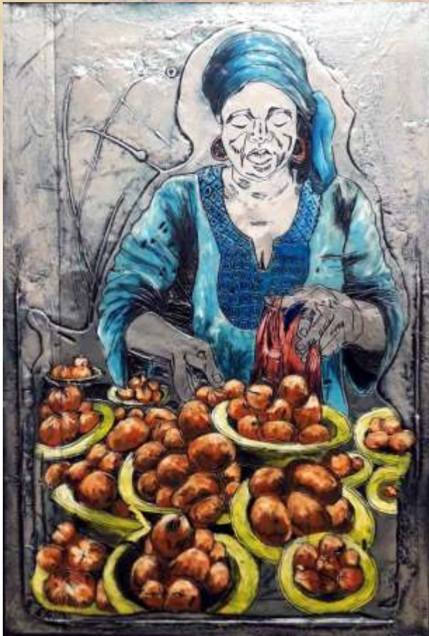
Iya Taiye, metal foil, 76cm x 106cm, 2019