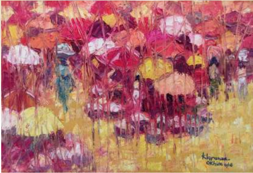
Kasuwa Series, oil on canvas, 76cm x 107cm, 2018