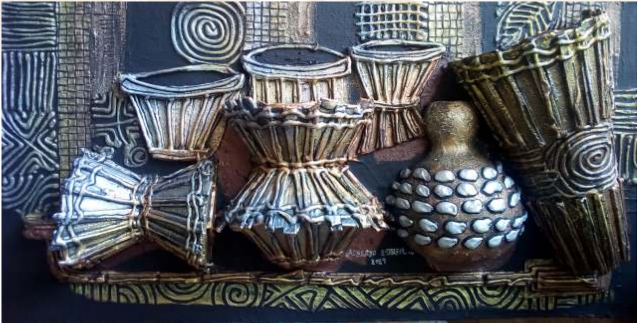
African Drums, mixed media, 41cm x 82cm, 2019