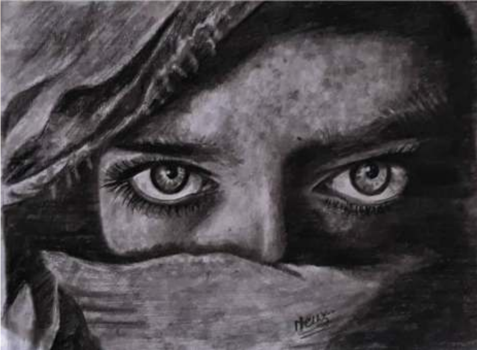
Fierce, pencil on paper, 31cm x 25.5cm, 2019