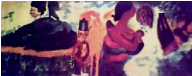
Afi Ekong, Iya Ibeji Ati Ibeji, oil on canvas, 122cm x 61cm, 1963