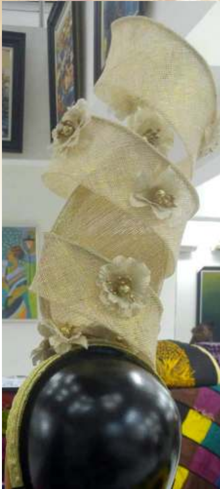
The 5G WIFI Fascinator, 2019