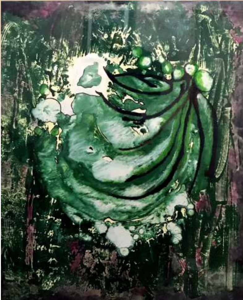
Untitled, mixed media, 76cm x 87cm, 2018