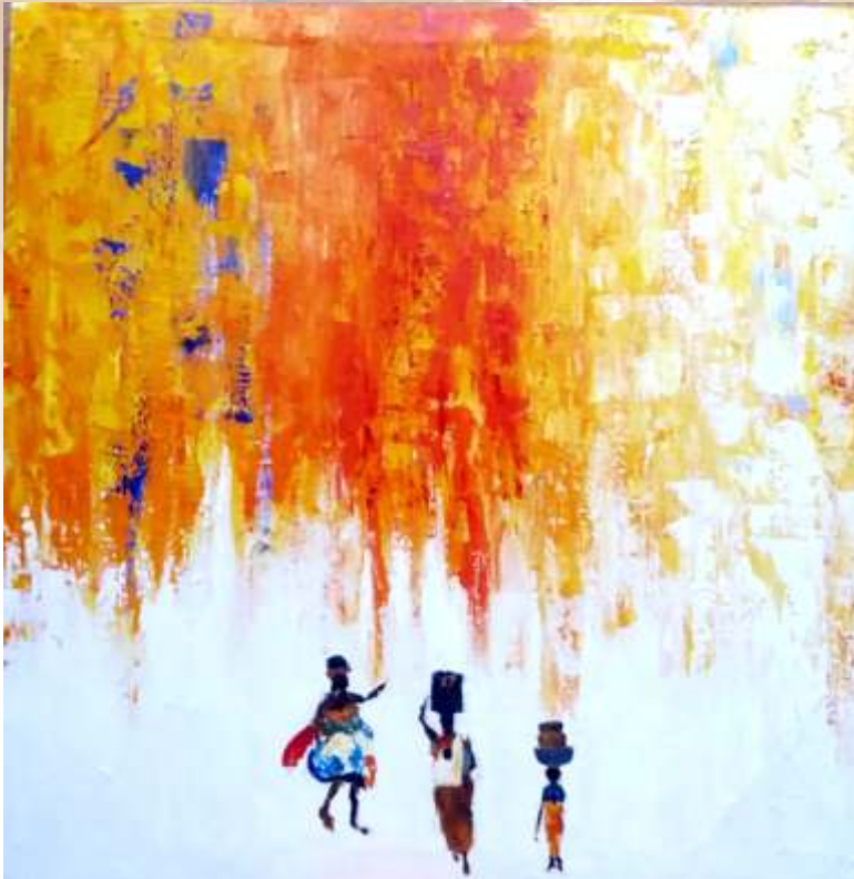
My Strength Lies In Hard Work, acrylic on canvas, 91cm x 94cm, 2019