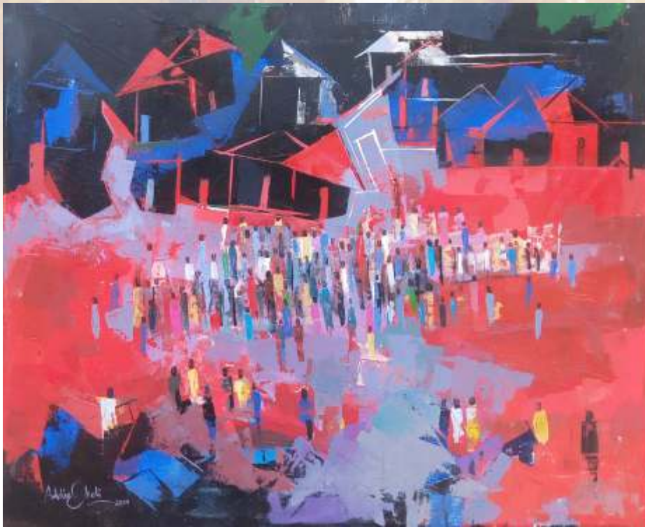
Village Gathering, acrylic on canvas, 18.5cm x 23cm, 2019