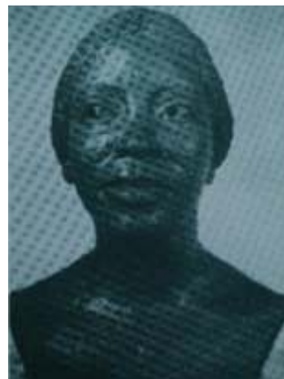
Ona, patinated terracotta, 35cm, Collection of Nat. Gallery Of Art, Lagos