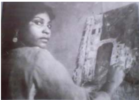
Afi Ekong, A House in Kano City, oil on canvas, 1962

Afi used her medium (painting) well and succeeded in projecting the Nigerian culture effectively. Her subject matters are educative, likewise her use of colours. Afi did not produce 'art-for art-sake', instead she was interested in the content of her theme. Most of her artworks are philosophical. Some of these are Orisha Ogun , Iya Ibeji And Ibeji , Afi's style consists covering the picture plane with figures, and she applied her colours freely without paying much attention to details in most of her paintings, and was consistent with the style..