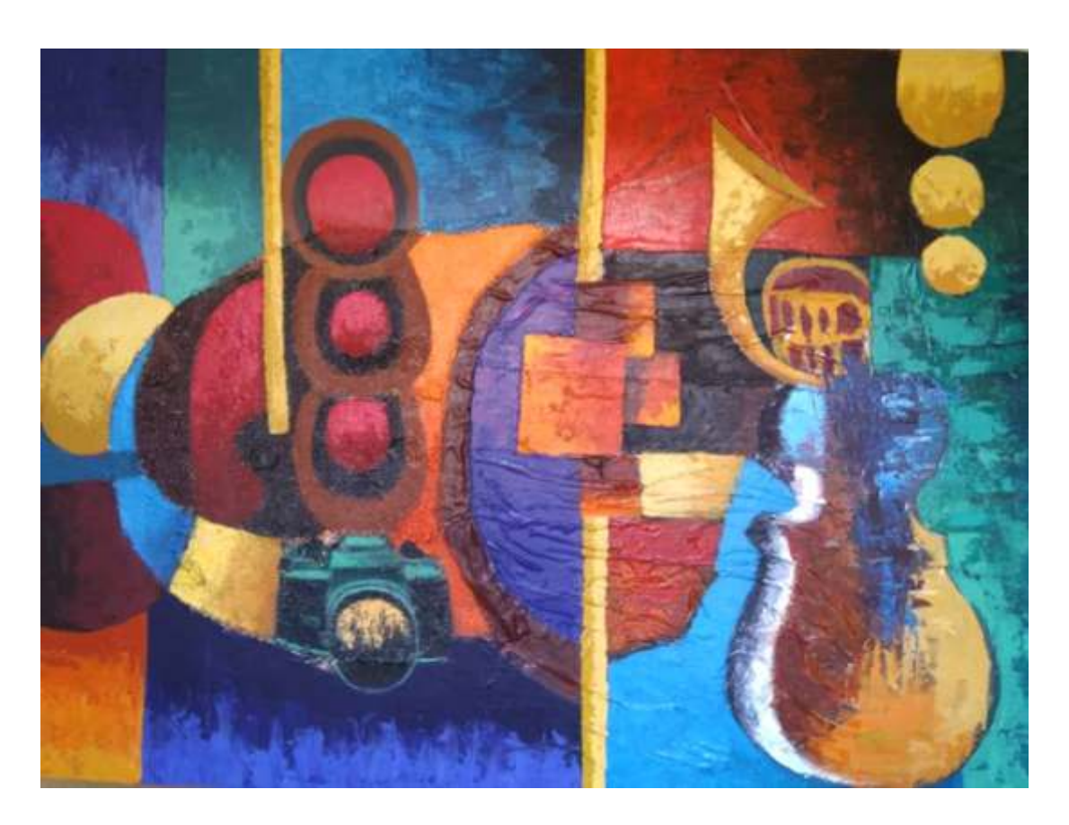
THERE IS SENSE IN CREATIVITY