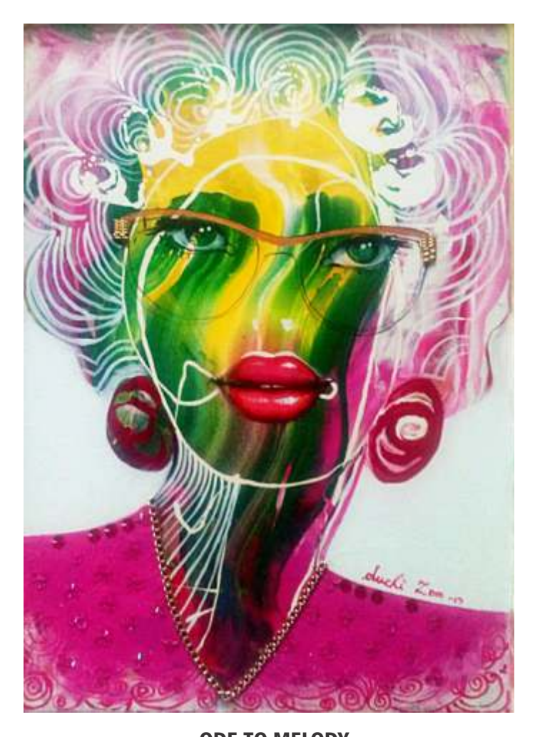
ODE TO MELODY 61cm x 81cm Mixed media on canvas 2019

Youth is a time when most people figure out who they are and what they like; when the practice of self-affirmation, independence and individualism often creates conflicts of interest, and a difficult choice between compliance and rebellion. The fluidity of the patterns and interlacing of the colours in this piece indicate a very personal rhythmic dance to this melody in the consciousness of an individual, and a testament to the uniqueness of each human being.