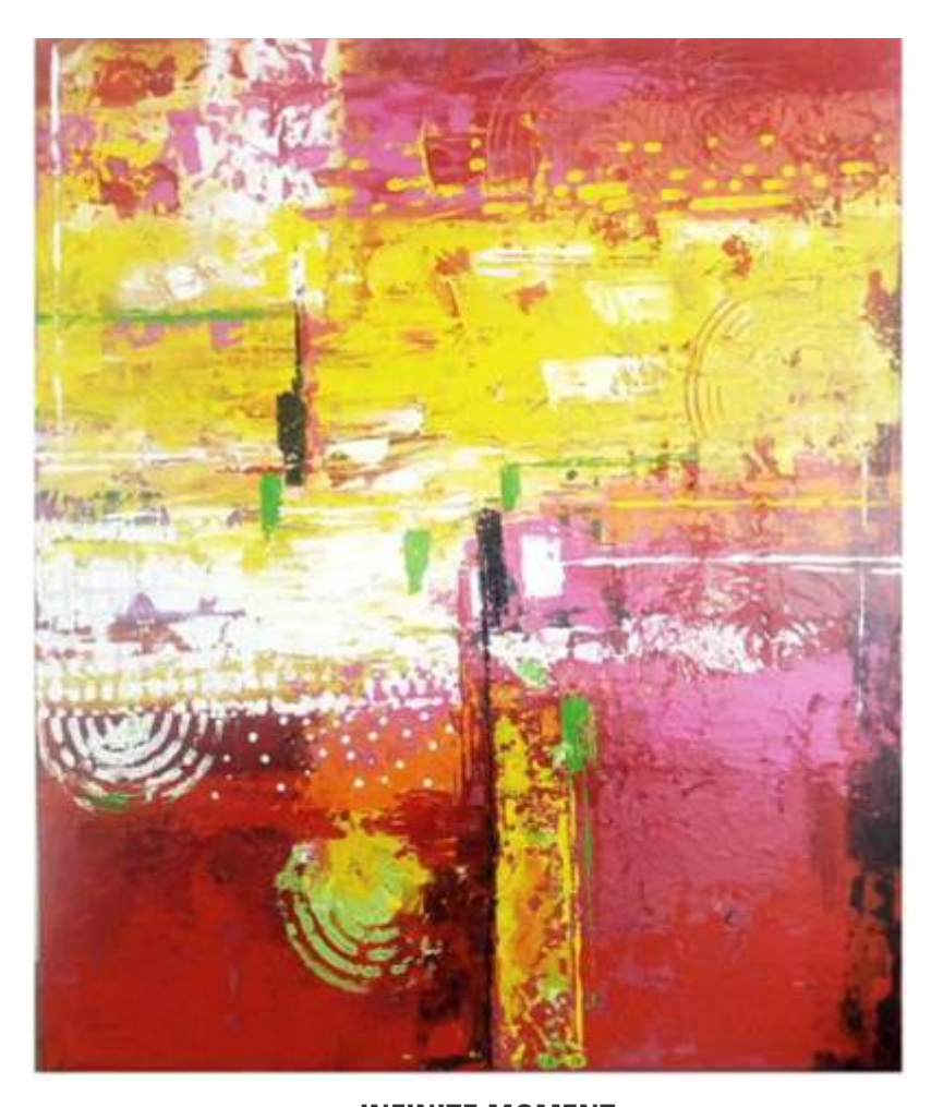
INFINITE MOMENT 66cm x 76cm Acrylic on canvas 2019

This painting depicts youth in the context of a journey with pit-stops and different stages, each having their own peculiar characteristics and pockets of activities. Viewing each period as a continuum in life encourages an emphasis on the accompanying experiences and the concept of individual relativity rather than a rigid time structure. The dominant colours which are red and yellow depict energy and creativity, which in turn depicts youth.