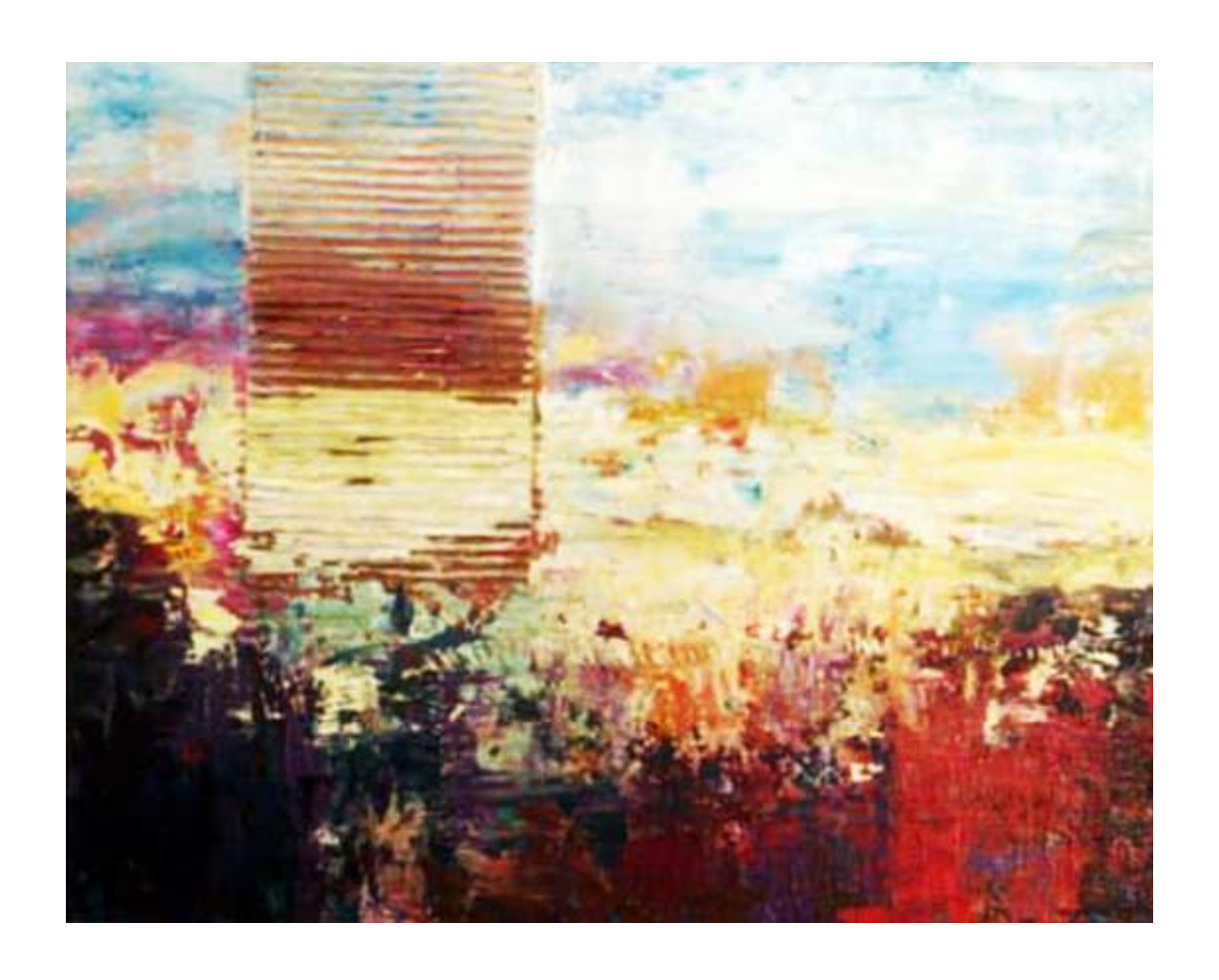
IT'S ALL IN THE MIND