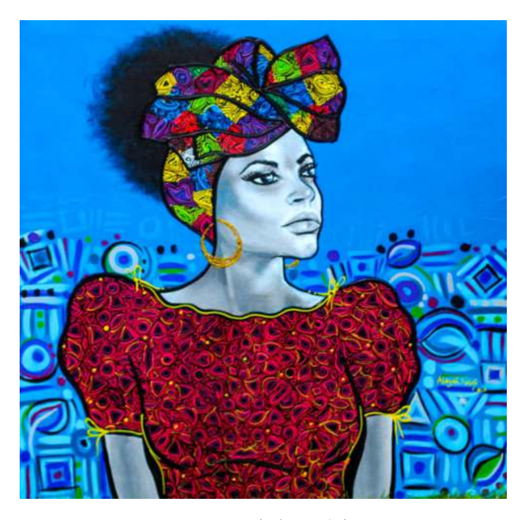
DAY DREAM (Ankara Series) Acrylic, paper and fabric on canvas 91.44cm x 91.44cm 2019

The artist tries to recreate the "Ankara" head wrap which the girl wears using Paper Cutting Technique as her medium. This is the first in the Ankara Series. The painting depicts a girl lost in thoughts as she tries to figure out how to be successful in the future and she knows being creative in life is the best way to apply her abilities. She loves fashion and will strive against all odds to achieve this.