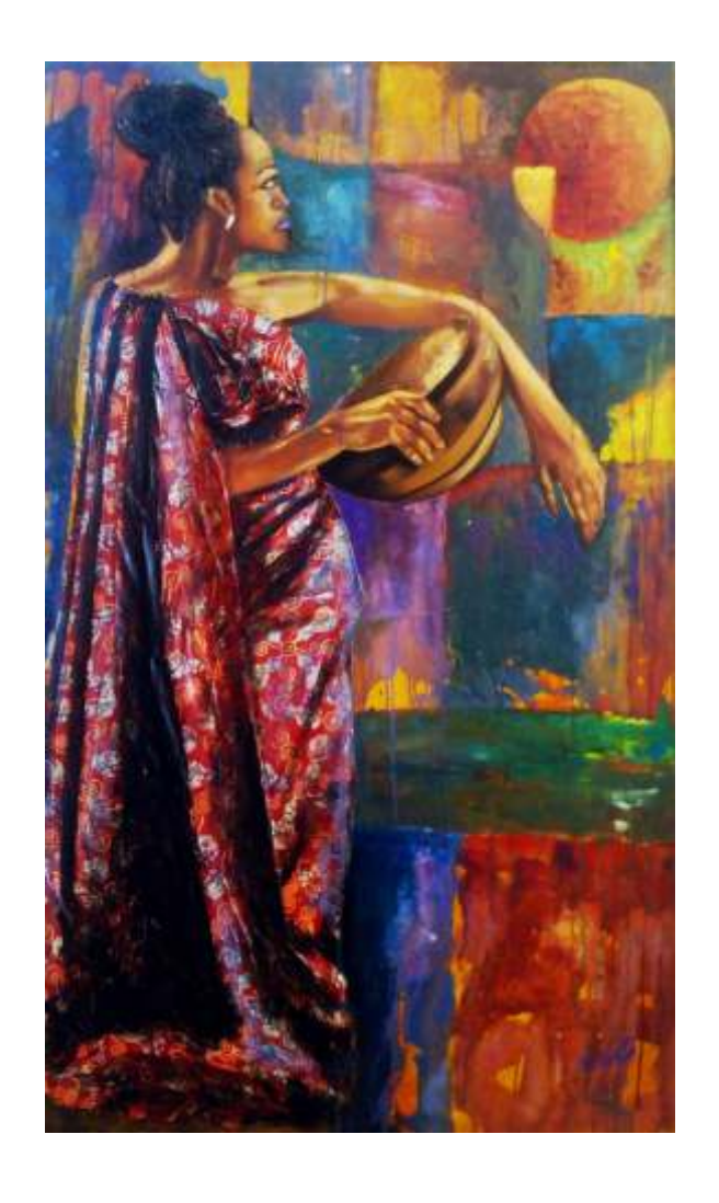
LOOKING INTO THE FUTURE