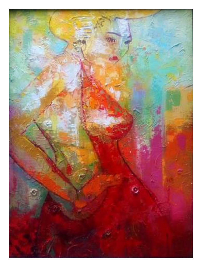
SUMMER 58cm x 74cm Mixed media on canvas 2019

From a physical standpoint, just like the earth, the human life cycle has its seasons, and youth can be likened to summer; intense, hot and fiery. Societally, just like summer, youth is the most celebrated, favourable and desirable of all. However, after summer comes fall, and soon enough, winter and so whatever season you find yourself, embrace its unique characteristics and be the best version of you regardless.