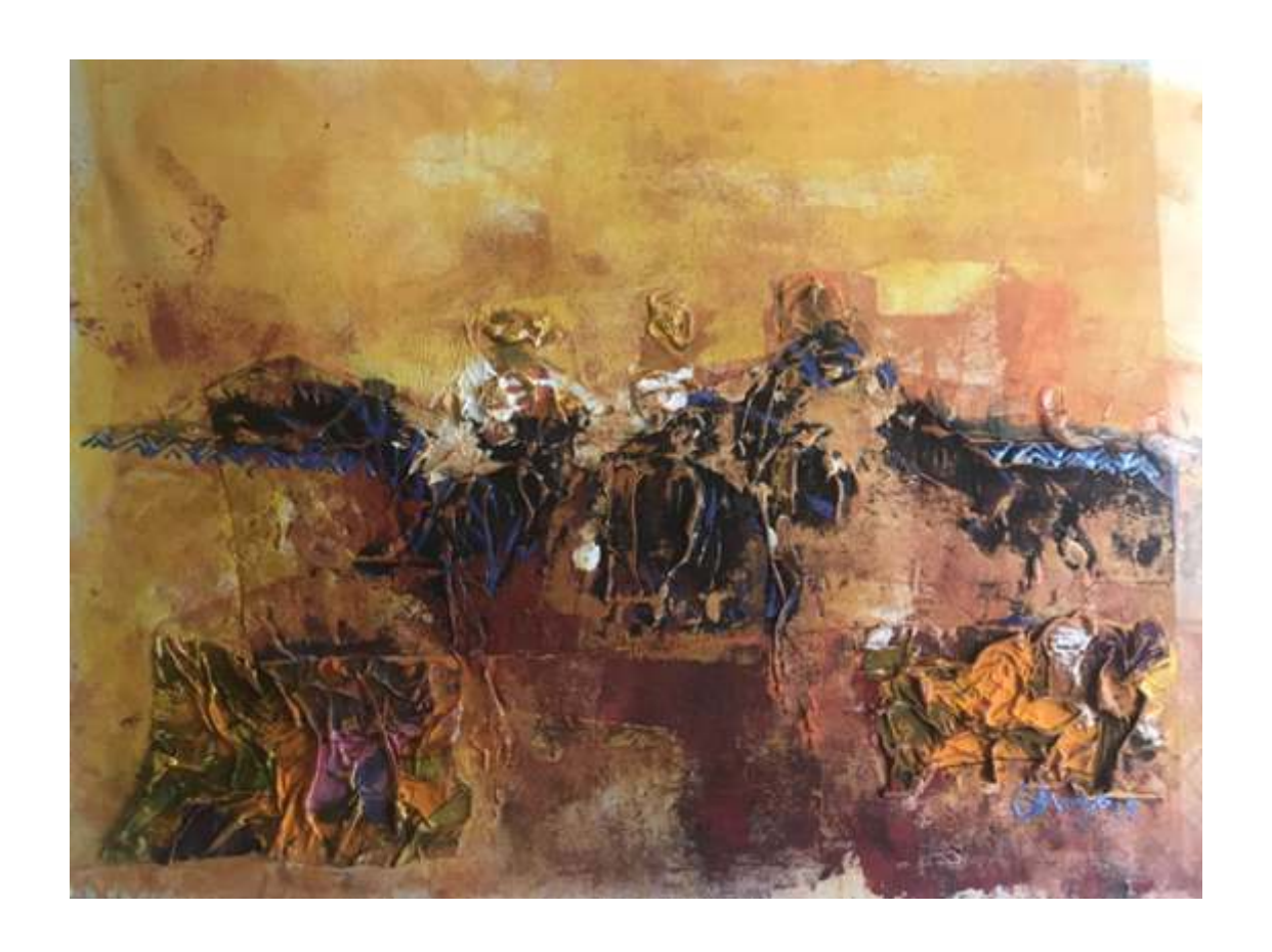
INSPIRE HOPE 102cm x 80cm Mixed media 2019

A good team can inspire hope, ignite imagination and spark creativity. The youth need to work together to encourage and improve themselves. Let yourself go and others won't let you go!