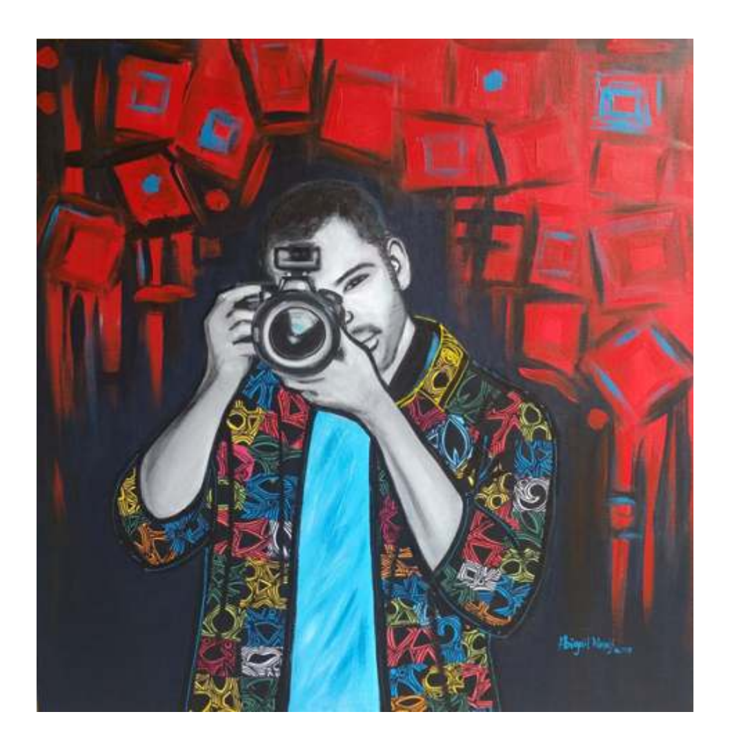
THE STORYTELLER (Ankara Series) Acrylic and paper on canvas 91.44cm x 91.44cm 2019

The photographer depicted in this painting captures images not only for the moment, but rather as a collection of images which tells a story. These stories are based on the creativity, which he applies while creating each photo. The pictures he captures leave different lasting impression on their subjects.