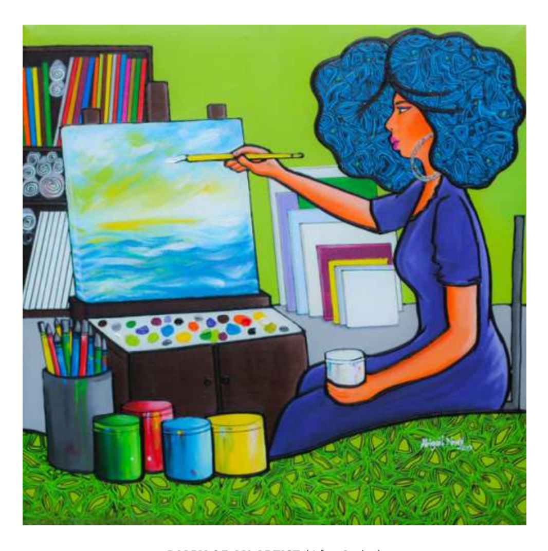
DIARY OF AN ARTIST (Afro Series) Acrylic, paper and fabric on canvas 91.44cm x 91.44cm 2019

An artist is a creative individual who tries to capture moments, memories and thoughts through their art. This painting depicts a painter who creates colours. This process is captured in various medium and colours. Since this is continuous it becomes a journey. This journey becomes their diary because it is not only a story but a visual interpretation of events of both present, past and future.