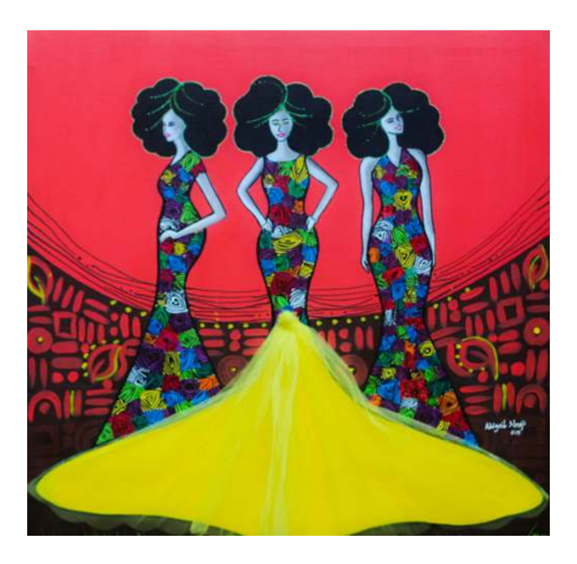
STANDING OUT (Fashion Series) Acrylic, paper and fabric on canvas 91.44cm x 91.44cm 2019

The ability to think outside the box and be different makes one stand out. This painting depicts a fashion designer who among other designers decides to go the extra mile to create something different from others using the same materials.