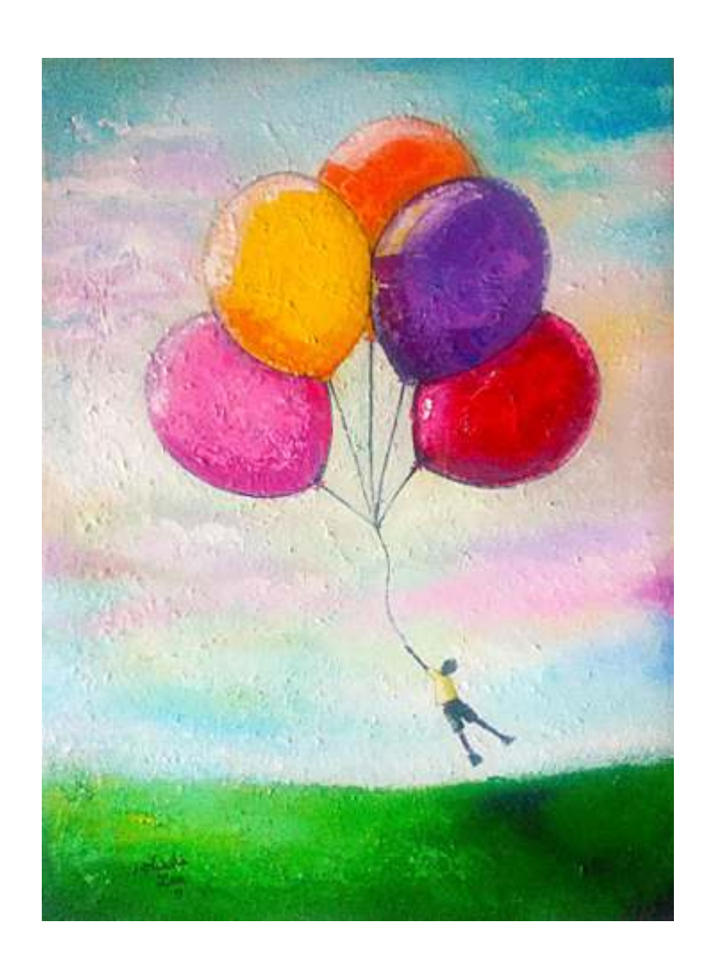
JOURNEY 70cm x 92cm Acrylic on canvas 2019

A lighthearted approach to things enables the mind to imagine and attain greater heights. The expression of youthful capacity to soar or travel mentally and physically, allows for a simple approach to complex interactions, spontaneity and freedom from constraints.