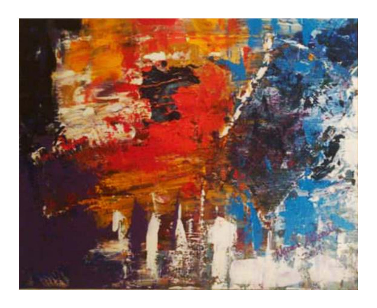
DESPITE ALL ODDS