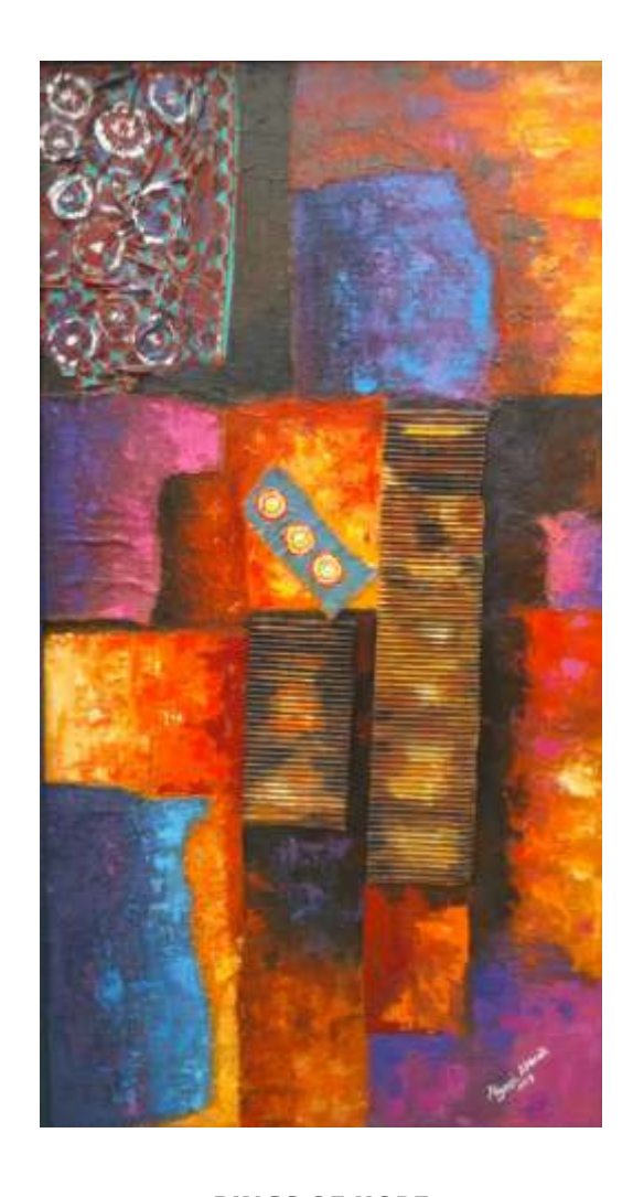
RINGS OF HOPE 103cm x 177cm Mixed media 2019

This painting is depicted with discarded materials, using bright colours to form the design. In your everyday struggle, you will experience different challenges, but at the end of the day, you will succeed in your chosen career.