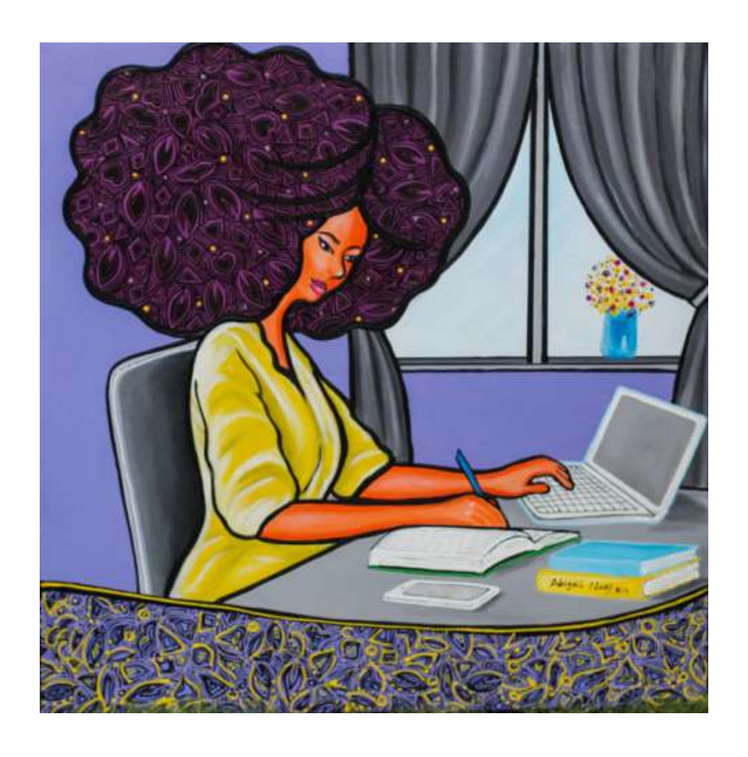
EDITOR-IN-CHIEF (Afro Series) Acrylic, paper and fabric on canvas 91.44cm x 91.44cm 2019

The Editor-in-Chief has lots to do through writing, reading and researching and this she achieves through creativity. She has to do this with utmost care because whatever she puts out there is what everyone would enjoy reading. But by applying creativity to her skills will make her job more interesting.