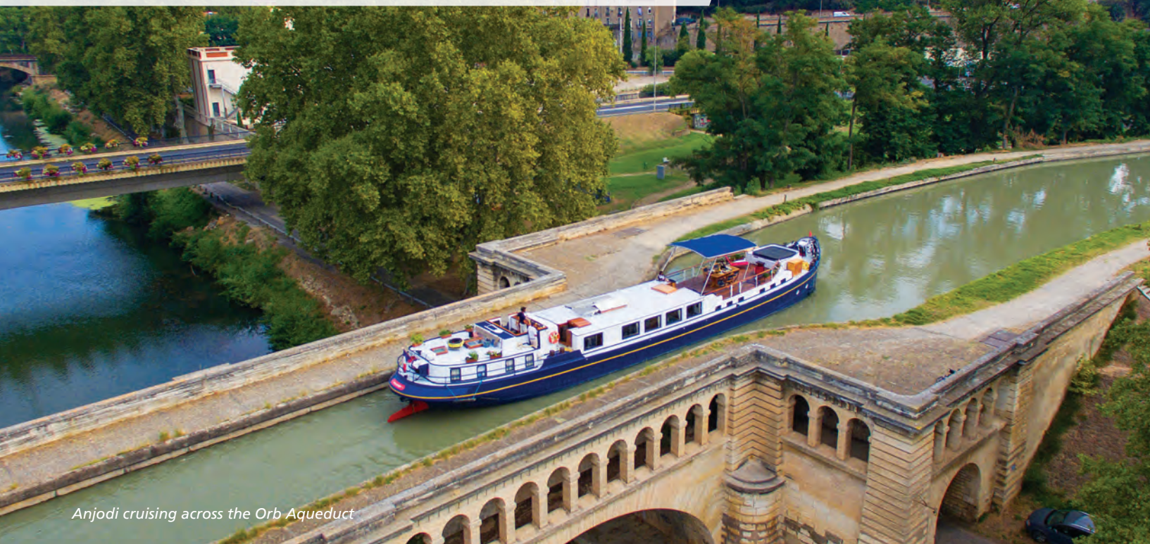
Anjodi cruising across the Orb Aqueduct

A hotel barge cruise is a very special way of exploring many of the glorious inland waterways of Europe, particularly those that larger river cruisers just cannot reach.