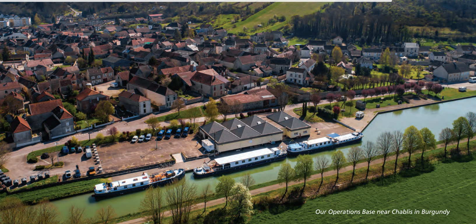
Our Operations Base near Chablis in Burgundy

The hotel barges in our 17-vessel fleet offer a wide variety of styles, sizes and pedigrees due to their specific purpose when originally built, so each one has a unique history.