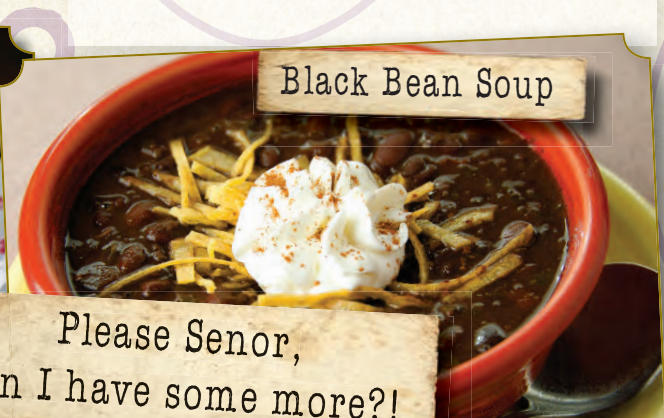
Black Bean Soup