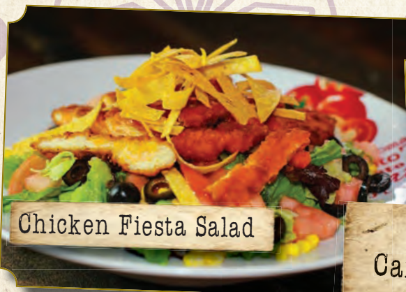
Chicken Fiesta Salad

Our homemade chicken broth served with pico de gallo, house rice, and shredded chicken topped with tortilla strips