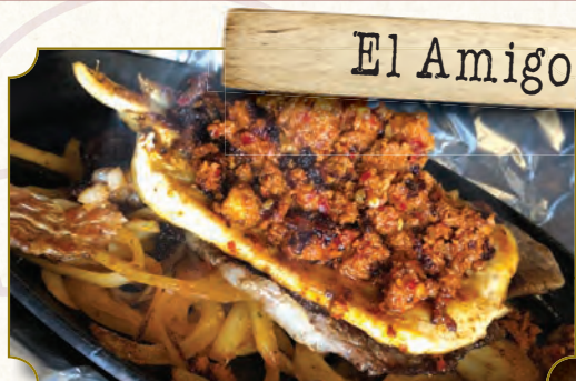
El Amigo Camarones a la Diabla

Served on a hot skillet with grilled onion Carne Azada, grilled chicken and topped with homemade chorizo served with one side 17.50