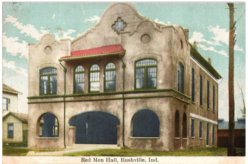
Red Men Hall, Rushville, Ind.