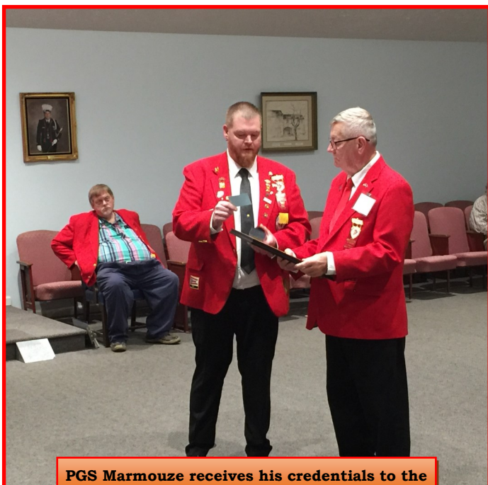
PGS Marmouze receives his credentials to the Great Council of the United States