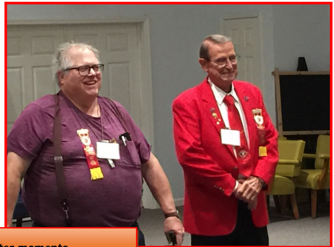
Some lighter moments