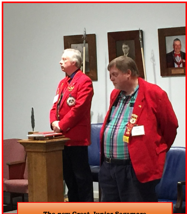
The new Great Junior Sagamore