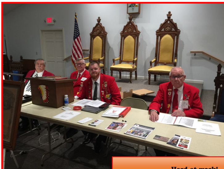
Hard at work!