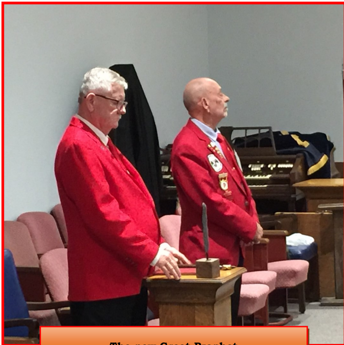
The new Great Prophet