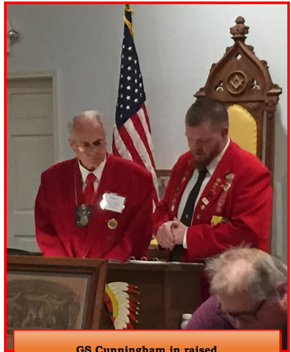
GS Cunningham is raised