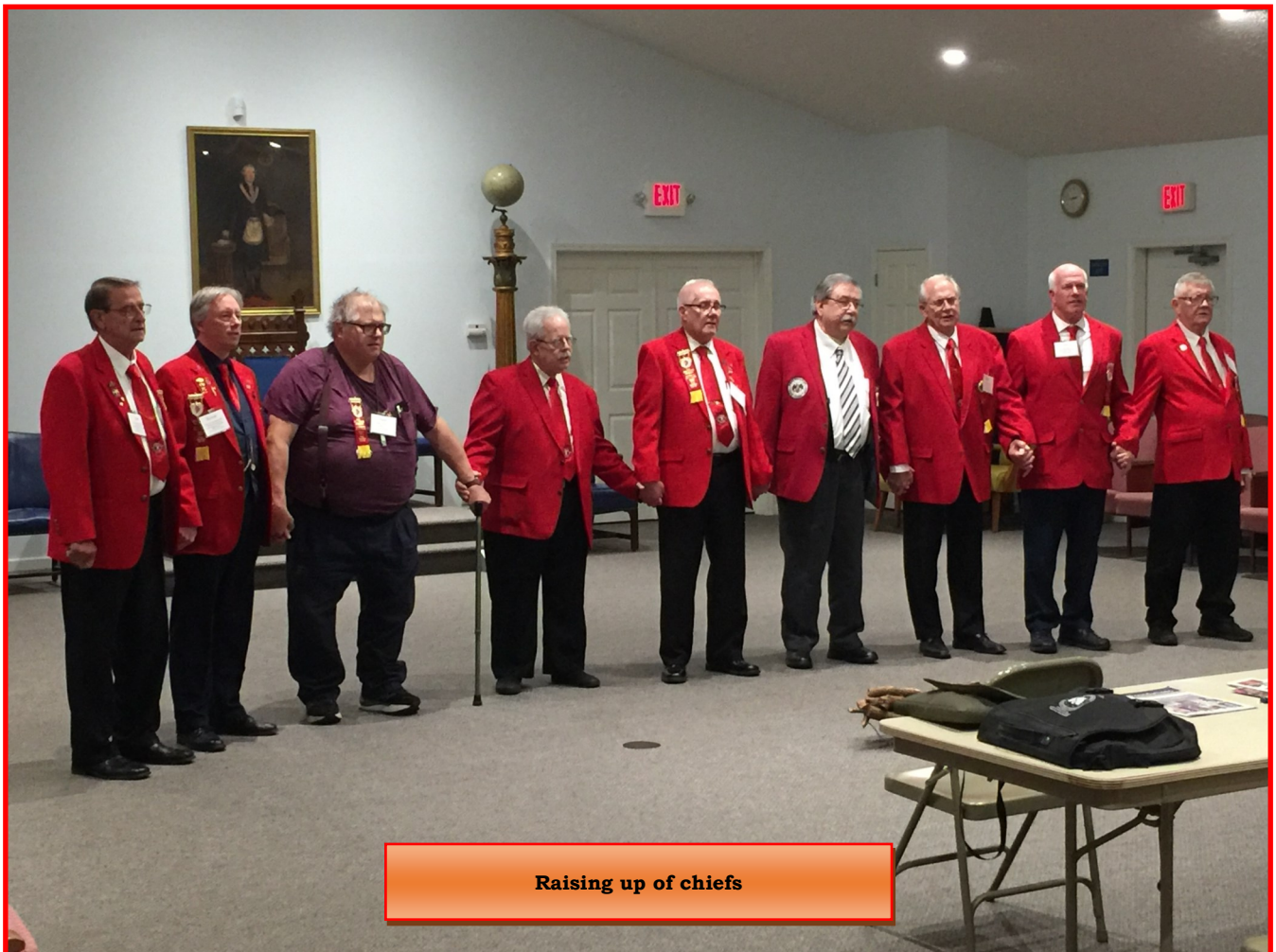
Raising up of chiefs