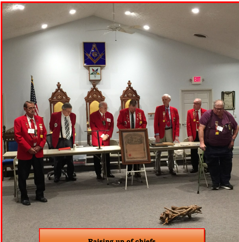
Raising up of chiefs