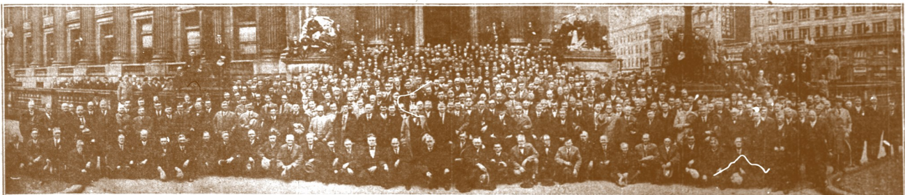
When the tom-toms sounded for the annual Great Council of the Indiana Red Men this week in Indianapolis, 795 "braves" responded to the call to gather for the lighting of the great sun fire. The Red Men are shown in this picture gathered on the steps of the U. S. Federal Building. The election of state officers for the Great Council on the first ballot was an unusual feature of this meeting.