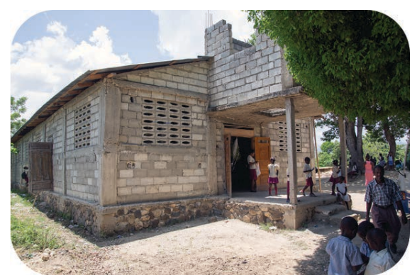
Our Lady of Deliverance chapel/school in Noyau village, location of a HOM Mobile Medical and Dental Clinic during our April trip.