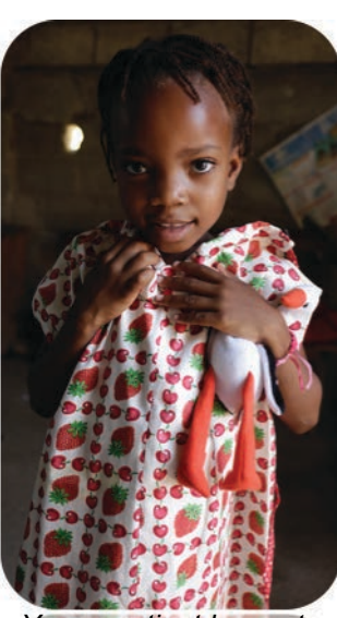
Young patient happy to receive a dress and toy.