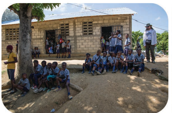
St. Vincent DePaul chapel/school outside the city of Hinche, location of a HOM Mobile Medical and Dental Clinic.