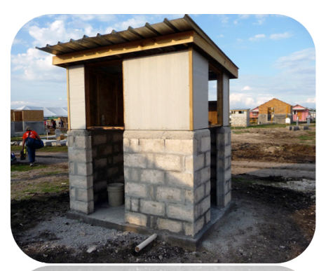
Each home will have its own restroom with side washing room. Normal Haitian bathing method is using a water pail. The human waste will be recycled into compost.

Haiti Outreach Mission Issue Six December 2012