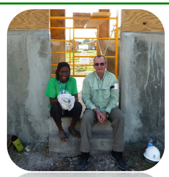
Our crew worked on houses 509 and 510. Putting the wooden upper walls up was the first task.

Our home for the week. We were in a HUGE high ceiling tent that was divided into four 18-person rooms! Most tents were of the 2-4 person variety.