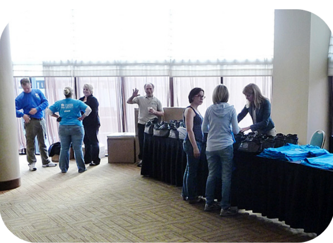
Trip and orientation started in Atlanta.

This map shows Leogane, the site for the Habitat for Humanity home construction where we worked. It was at or near the 2010 earthquake epicenter. ~80% of the town's buildings were damaged or destroyed. The Episcopal nursing school at Leogane received only very minor damage in the quake because it was built to international standards. A quarter million people died because Haiti is a developing country, not because of a magnitude 7 quake.