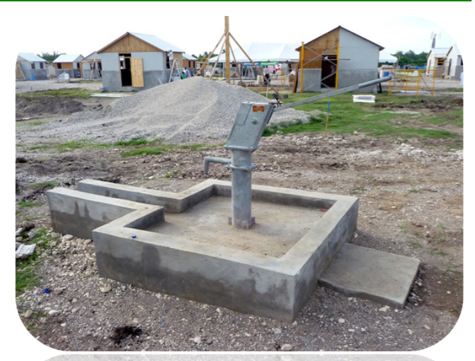
There will be community water pumps for the families through out the housing/ community project.