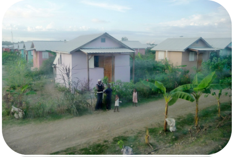
Another pic of 2011 homes.... Haiti Outreach Mission was a partner in that build also. (See Newsletter 3 - Part one - January 2012