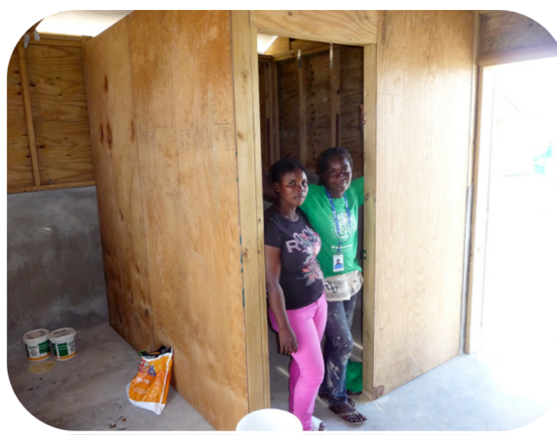
Bedroom prior to adding door. I would estimate that this master bedroom measured about 6'x8'.