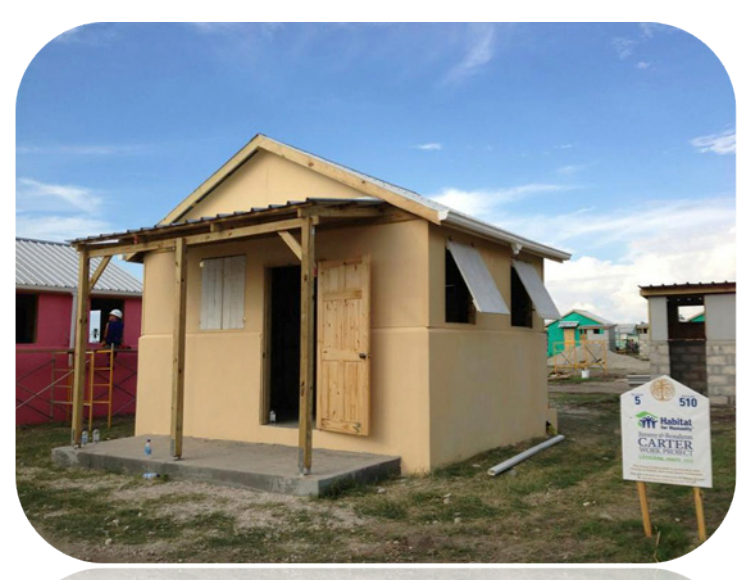
Front view of house 510.