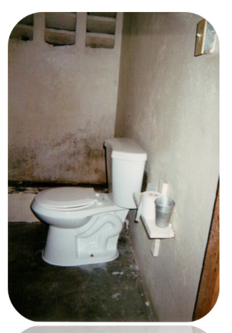
New water conserving toilet installed at St. Louis rectory.