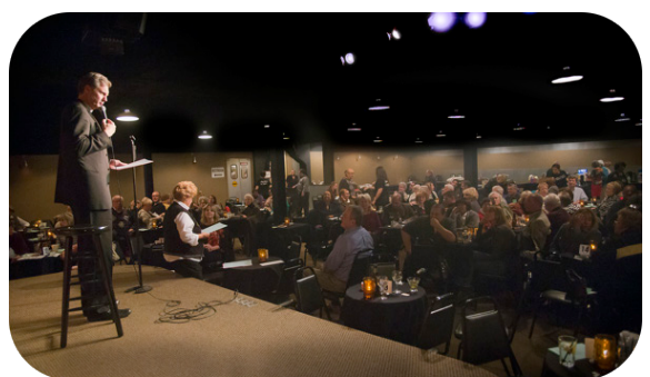
Thanks to all who attended. A great time was had by all.