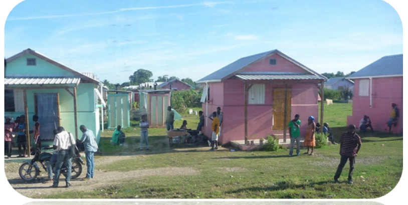
154 homes were built last year and are now occupied. Woman to left of the pink house is cooking in side yard. Typical developing world method: Three stone fire on the ground with round-bottomed pot.