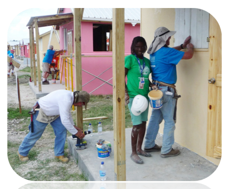
Hanging window shutters while still painting. Time is getting short.

Haiti Outreach Mission Issue Six December 2012