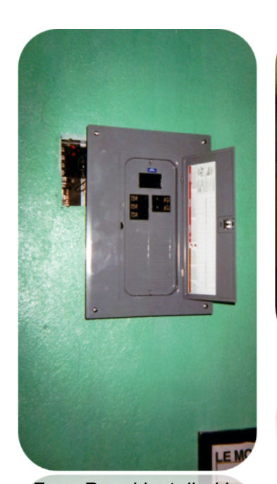
Fuse Panel installed in St. Pierre school principal's office on the second floor – over the old panel.

One future project may be that the orphanage is in need of painting.