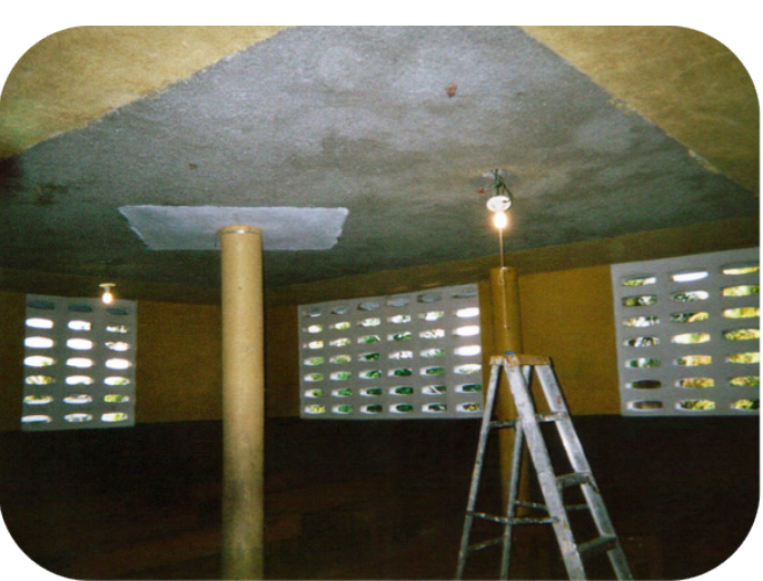
Lights installed in St. Pierre school classroom.