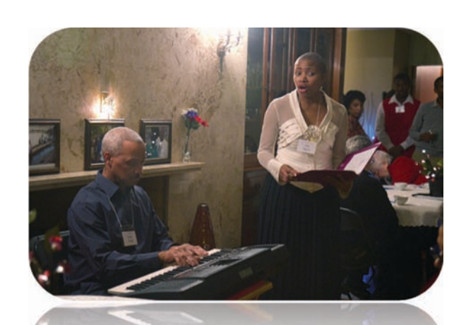
A musical tribute to HOM members that have passed.