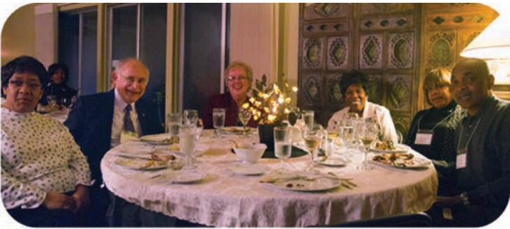
A number of Haitian foods are served during the evening, including Griots (Glazed and Braised Pork), Riz au Champignon (Mushroom Rice), Poulet a l' Haitienne (Chicken), Chou Croute (Cole Slaw), and Gateau De Rhum (Rum Cake).