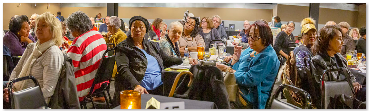
Potential silent auction winners waiting for their names to be called. A few of the auction items can be glimpsed in the background.