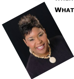
Comedy by: Crystal P