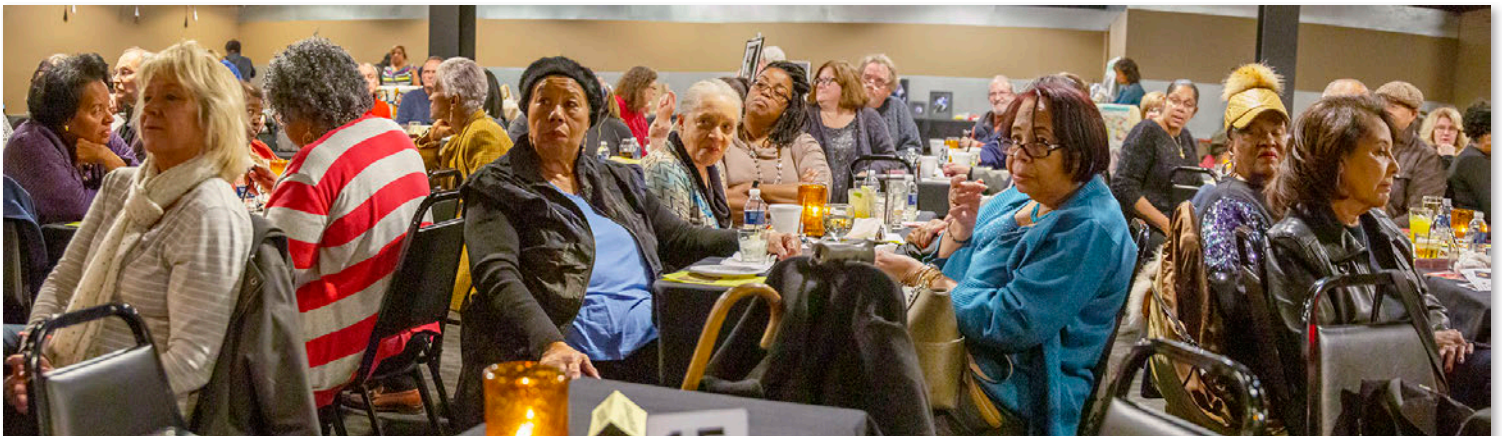
Potential silent auction winners waiting for their names to be called. A few of the auction items can be glimpsed in the background.