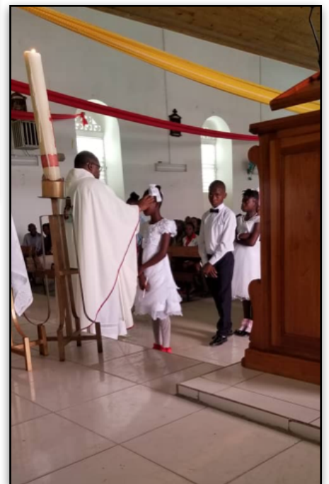
First Communion May 1, 2019