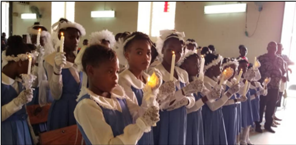
Baptism before the First Communion

I myself since September 21 am prisoner at the rectory. Fortunately, we celebrate Mass every day and we celebrate the sacraments. Despite the protests and violent demonstrations, in spite of firearms firing, the faithful come every day to the church. I stay between the church and the rectory.