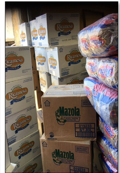
Purchasing food in the Dominican Republic