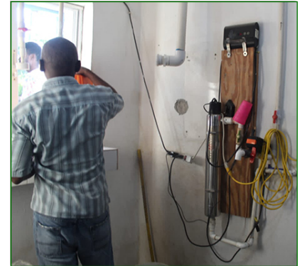
Water St. Louis located at Msgr. Remy Augustin School (the former St. Blasé orphanage) in Mirebalais.