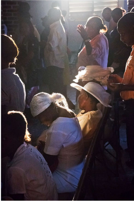
Mass is celebrated at St. Louis Parish in Mirebalais, Haiti. St. Louis is one of two partner churches Haiti Outreach Mission works with in Mirebalais. In August, the parish suspended Mass following an attack on the neighboring police station.

Haiti now. The clinic staff, especially the dentists and physicians, haven't gotten a raise in some 10 years, so recently we decided to give them a raise to help them keep up with everything that's gone so high."