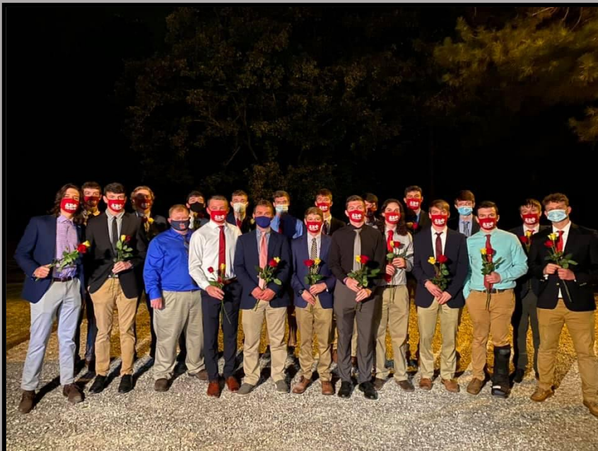
Above- Brothers gather in a zoom call during recruitment week. This is the method they used to meet with potential new members. Left- Initiation night for the Beta Theta Class.