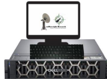
DISA-STIGs & Nessus Scan Cybersecurity Compliant COTS, FPGA, RHEL 8 OS, Modern Technology