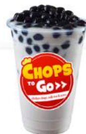
Pearl Milk Tea