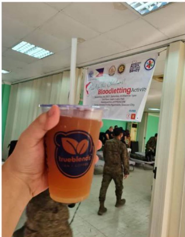
Donors got the chance to try our house blend iced teas!

With BS medical technology background, bloodletting has become my second nature, which plays a pivotal role in our company's corporate social responsibility efforts. Moreover, my service in the Philippine Air Force has ignited my passion for organizing extensive medical and dental missions to serve communities in need.