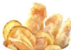
Chicken Chops with Fish Fillet