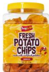
Fresh Potato Chips in Jar