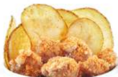
Chicken Chops with Chips