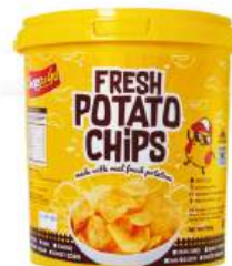
Fresh Potato Chips in Tub