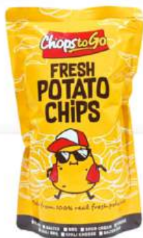
Fresh Potato Chips in Pouch