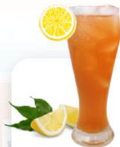
House Blend Iced Tea