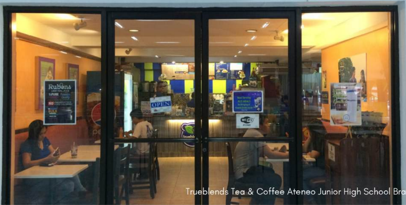
Trueblends Tea & Coffee Ateneo Junior High School Branch