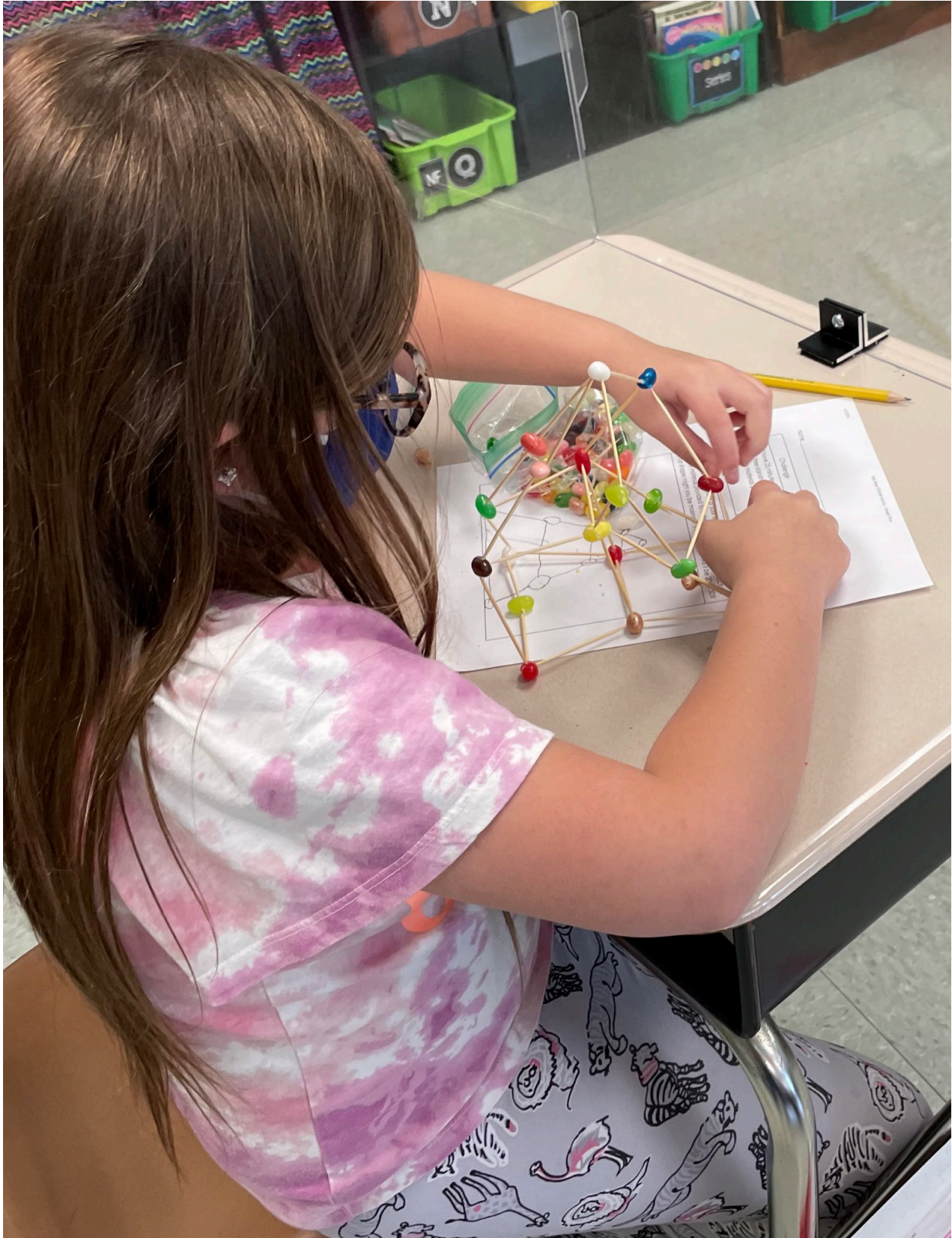
STEM Action Team Challenge