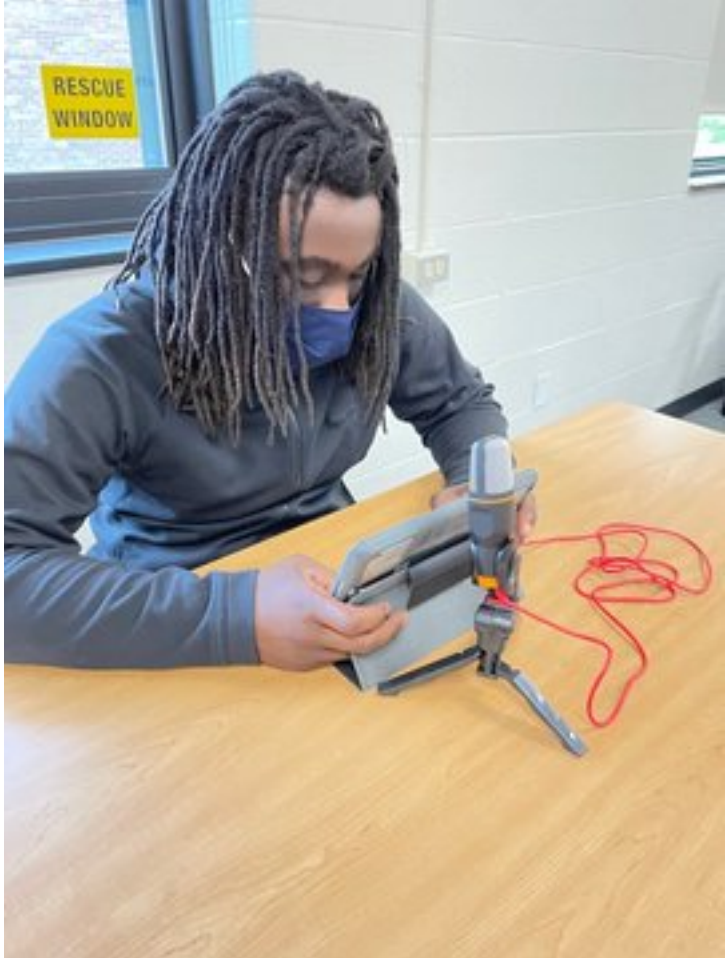
New equipment for HS Morning Announcements