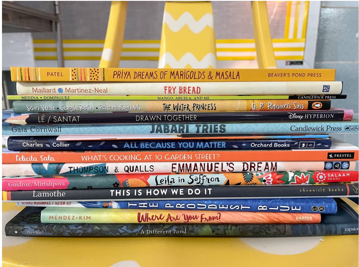
Books for Willow Ridge Lending Library