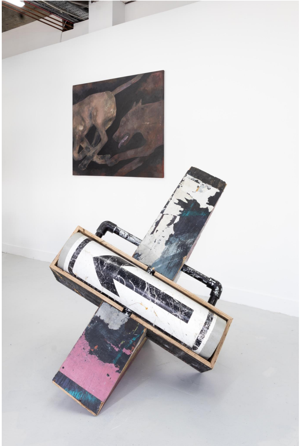
Photograph from Exhibition