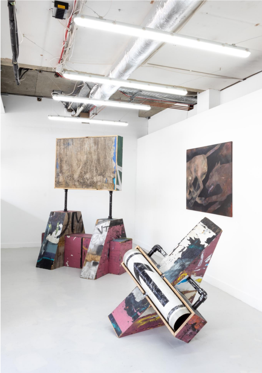
Photograph from Exhibition