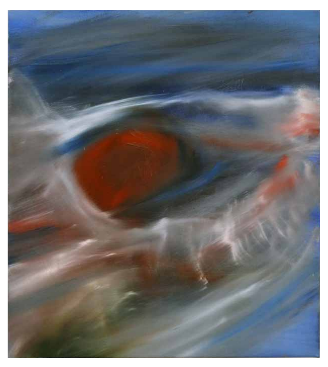
237 Hackney Road, London, E2 8NA

Exhibition: 28.09.2022 - 19.10.2022 Visit by appointment. Contact us by email or instagram.